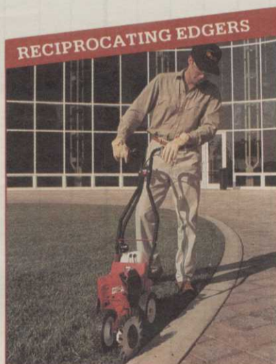
RECIPROCATING EDGERS The RedMax Reciprocating Edger's blade design reduces the danger of flying debris while you edge and trim along flower beds, walkways, and curbs.