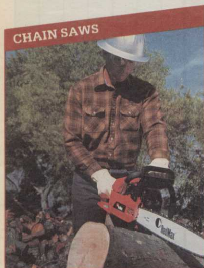
CHAIN SAWS The full line of RedMax chain saws is equipped with the power and durability to handle all your cutting jobs — from lumber to construction.

RedMax designs equipment with the innovation, power and features you need to get the job done quicker, easier, and safer.