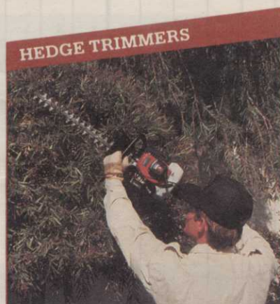
HEDGE TRIMMERS The RedMax hedge trimmer's unique, double-sided blades enable you to trim back and forth with precision and ease.

THE REDMAX RECIPROCATOR® 1989 OVERALL WINNER