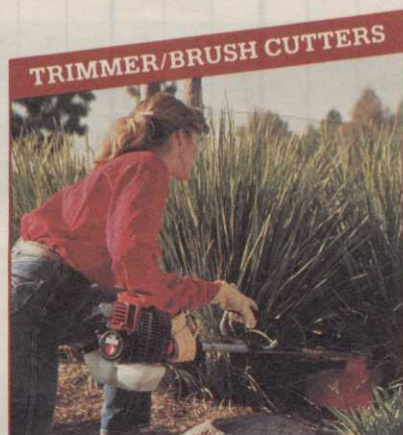
TRIMMER/BRUSH CUTTERS RedMax trimmer/brush cutters are designed to give you the power, reliability and comfort to make your trimming jobs easy.