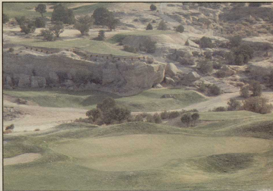
A panoramic view of Pinon Hills Golf Course in Farmington, N.M., shows the 11th green in the foreground and the elevation changes on No. 15 tees in the background. For more information on this course, designed by Finger Dye Spann of Houston, Texas, and others, see pages 10 and 11.

Niemczyk cited data showing that the "liquid injection subsurface placing system" they are developing can put the product Continued on page 31