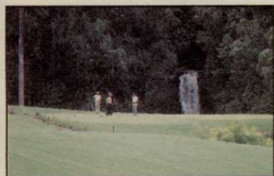
Prince Course in Kauai, Hawaii