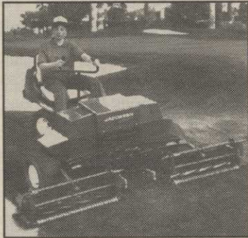
Jacobsen's Tri-King 168D