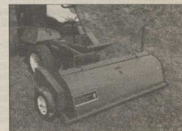
Olathe Plug Pulverizer

Contact Fox Valley Systems, Inc. 640 Industrial Drive, Dept. 422C, Cary, Ill. 60013-1948 (800) 323-4770. Circle No 261