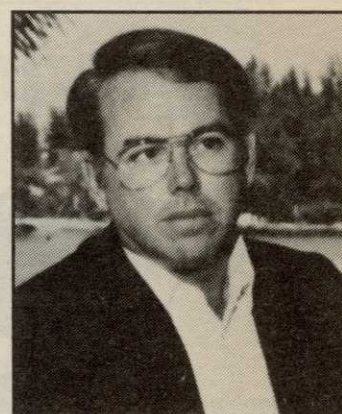
Tom Fazio Voted Best Architect of 1989

"I'm just amazed at the quality of products we (architects)