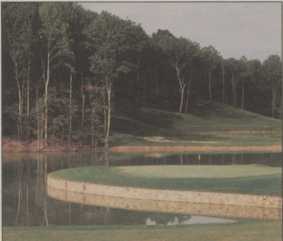
The second hole at Royal Lakes Golf and Country Club in northeast Georgia shows the handiwork of architect Arthur Davis. For more on new courses see pages 14 and 15.