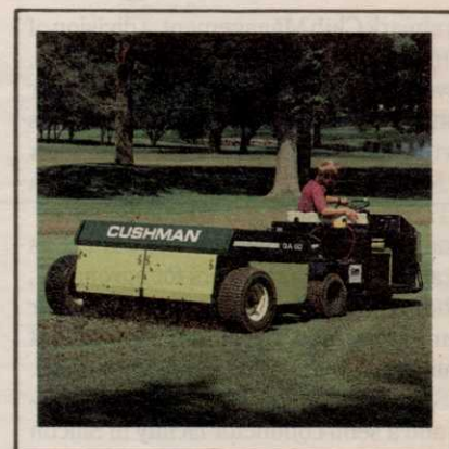
Coming Soon. Cushman GA60 Large Area Aerator The first in a new generation of 5th wheel accessories.