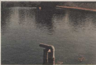
30 days after installation

man-hours attending to clogged filters, valves and screens. Fouled sprinklers. Blown irrigation pipes. And irate club members who can't understand how you could allow brown spots on the fairways. Algae mats on the water. And such a stench in the air!