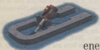
Toro AIRE-O 2 unit

As ponds age, oxygen is depleted. Algae proliferate simply because their natural enemies suffocate. Fertilizer runoff and effluent water only worsen this anaerobic condition.