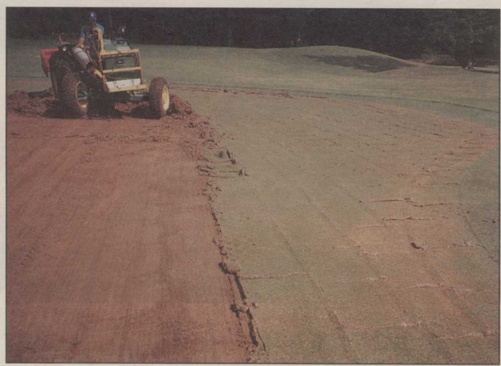
A worker at Sweetwater Country Club in Sugarland, Texas removes bermudagrass sod from a green damaged by this winter's record cold. The facility was among numerous Southern courses that suffered extensive winter kill requiring greens to be torn up and replanted. The extent of the damage wasn't known in many areas until the bermudagrass emerged from dormancy this spring.