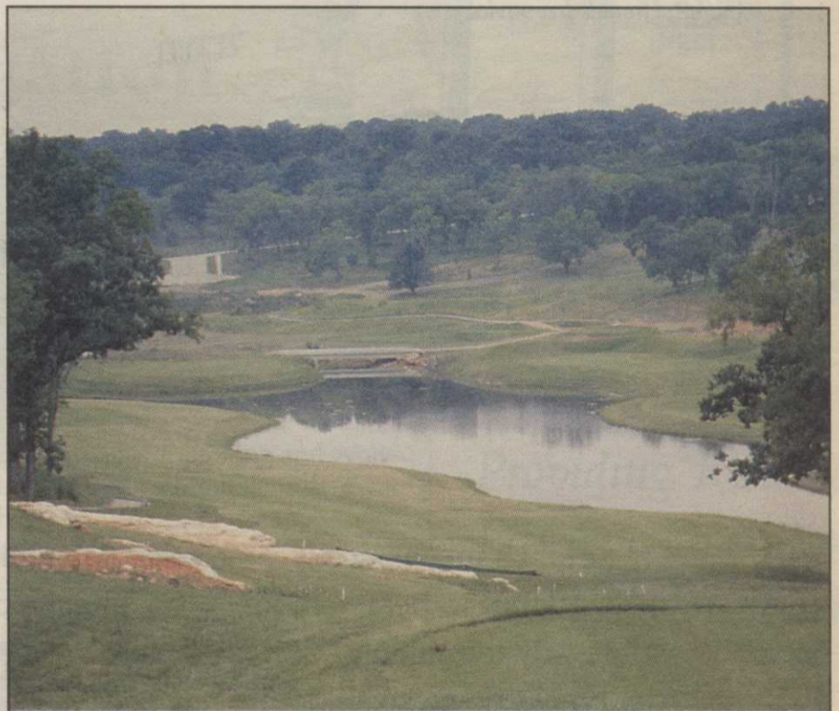
Beauty and danger come into play on this 18th hole at Highland Springs Country Club in Springfield, Mo. Designed by Robert Trent Jones Jr. and built by Greenscape, Ltd. of Menlo Park, Calif., the 18-hole private

course meanders around four lakes and over rolling terrain. More information on new courses around the country and a table listing courses on which plans have started in the last month are on pages 12 and 13.