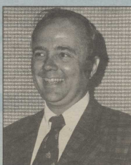
Robert Trent Jones Jr.