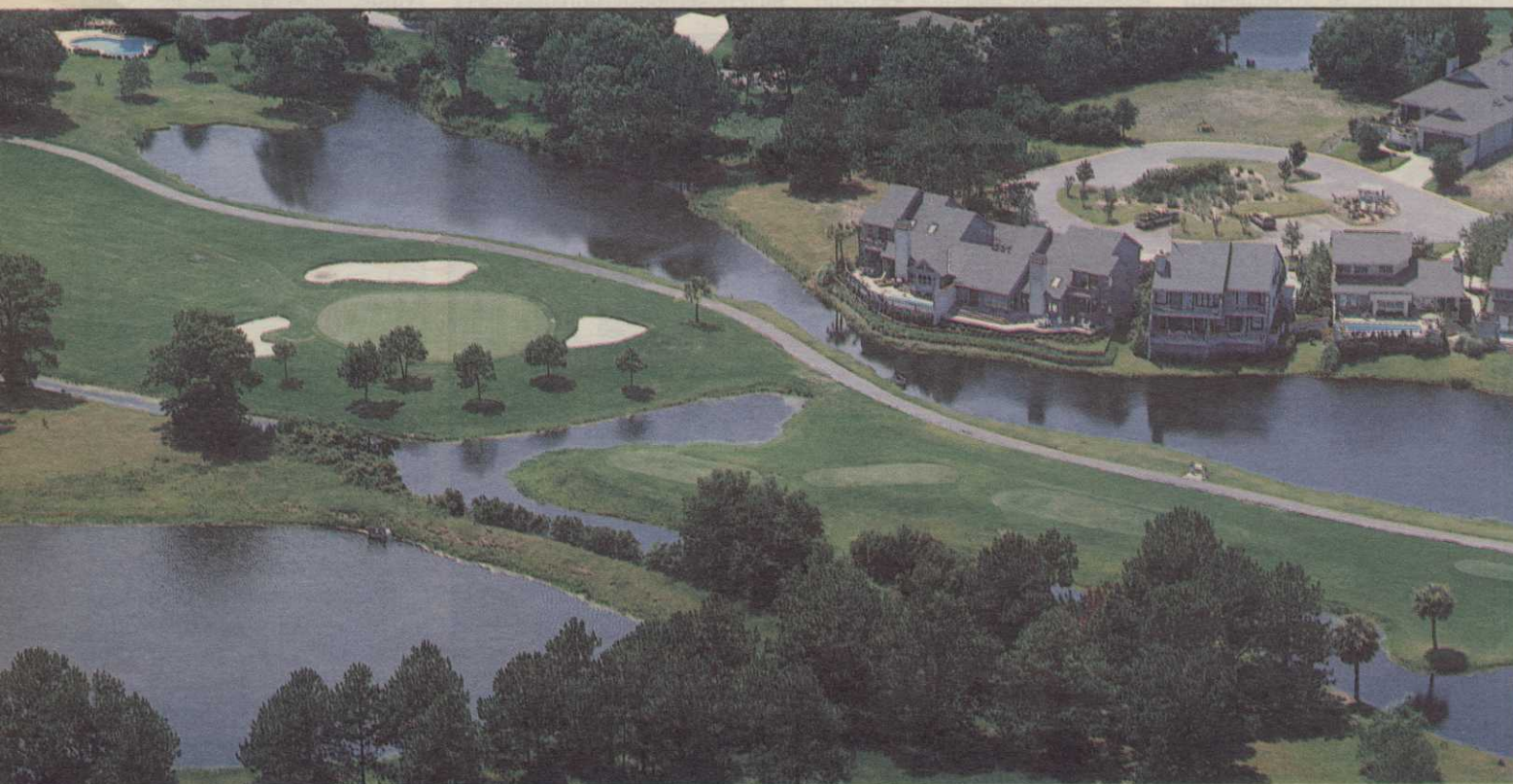
Palmetto Dunes CC, Hilton Head, SC