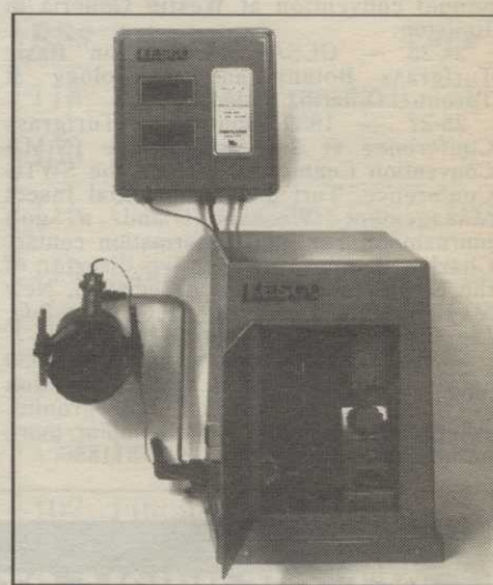
Lesco injection system