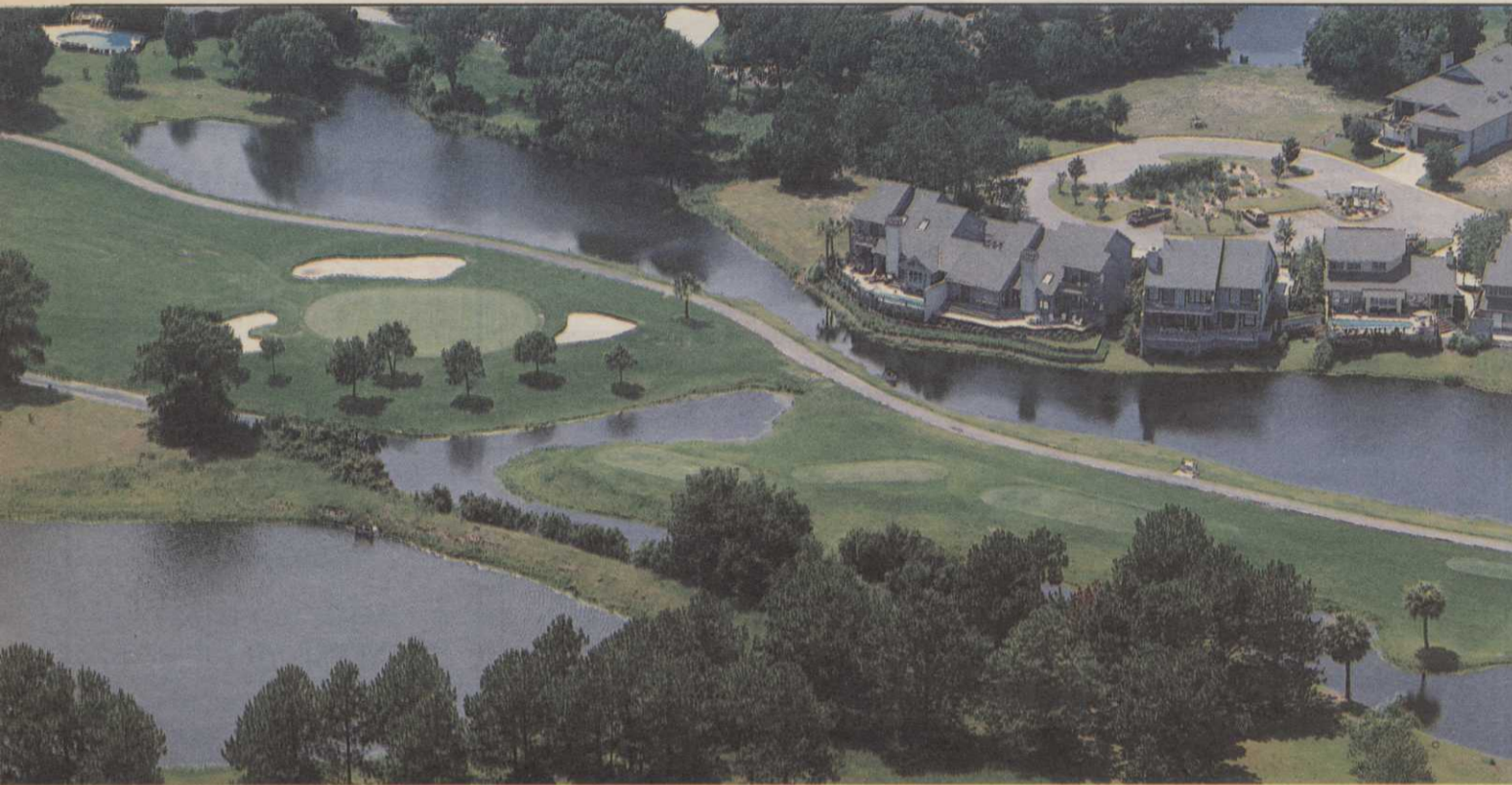
Palmetto Dunes CC, Hilton Head, SC

The Professional Golfers' Association of America, the world's largest sports organization, consists of more than 16,000 members and apprentices and is represented at more than half of the nation's 13,400 courses.