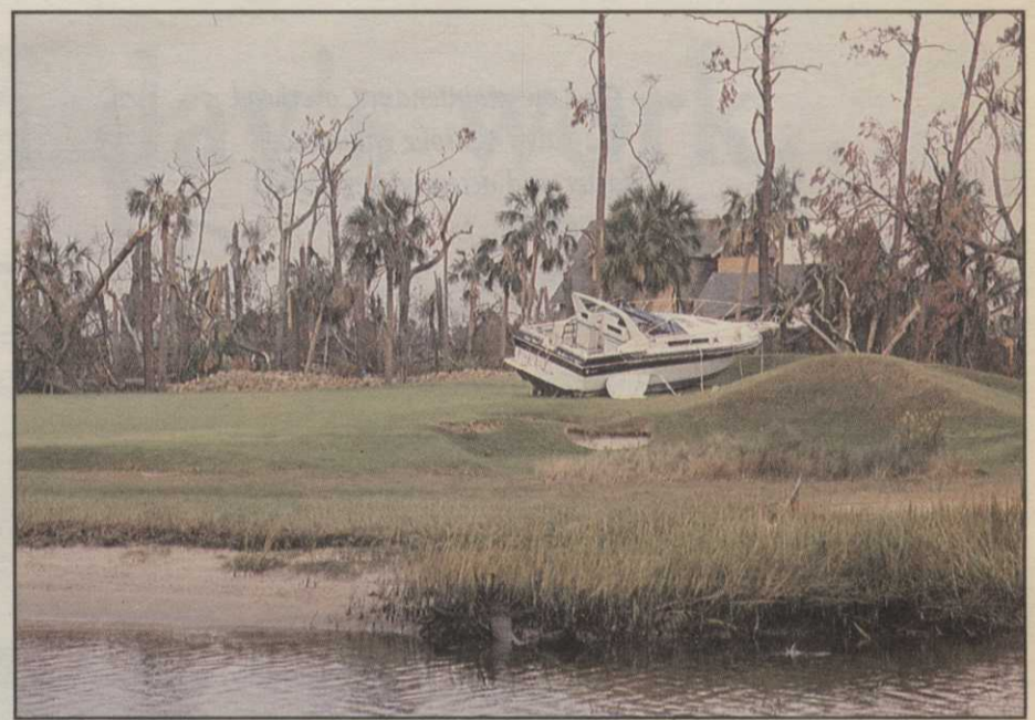
A boat rests on the 12th green at Wild Dunes' Harbor Course on Isle of Palms, South Carolina.

Courses from Charleston to the Grand Strand as well as some 200 miles inland were closed — for days, weeks, months, and some for as long as a year — because of the devastation Continued on page 34