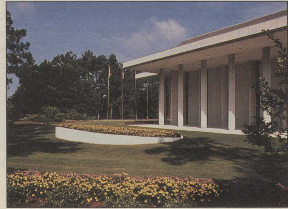
PGA World Golf Hall of Fame Shrine Gardens honor superintendents.