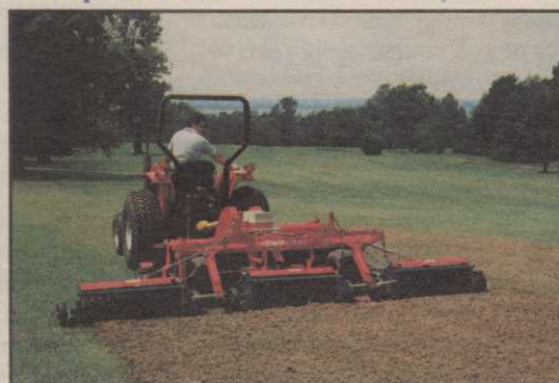
8. 5 Gang Vertical Mower