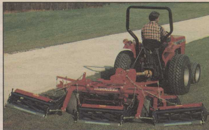
6. 3, 5 or 7 Gang Hyd. or Manual Lift P.T.O. Mowers