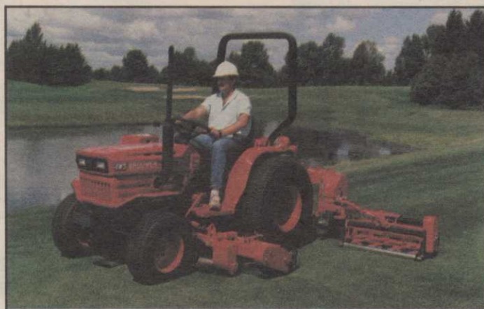
1. 3, 5 or 7 Gang Tractor Mount Mowers