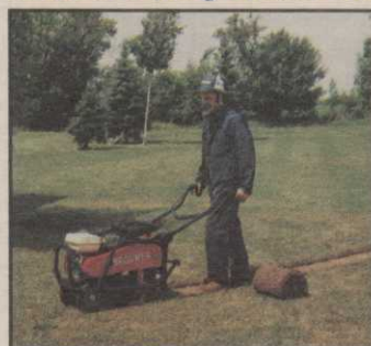
4. Sod Cutter MK.2™