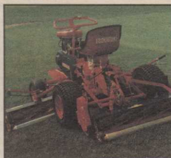
5. Triplex 376-A