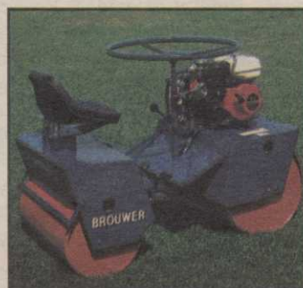
2. Turf Rollers 130, 224 & 235 3. 24 in. Seeder/Over Seeder