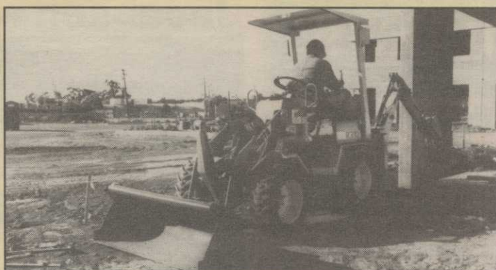
grees for the R410.

These loaders have four-wheel drive and fully articulating steering at angles of 41 degrees for the R310 and 40 de-