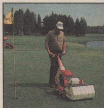
7. Brouwer Greens Mower