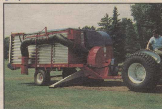
9. Large Capacity Brouwer-Vac™