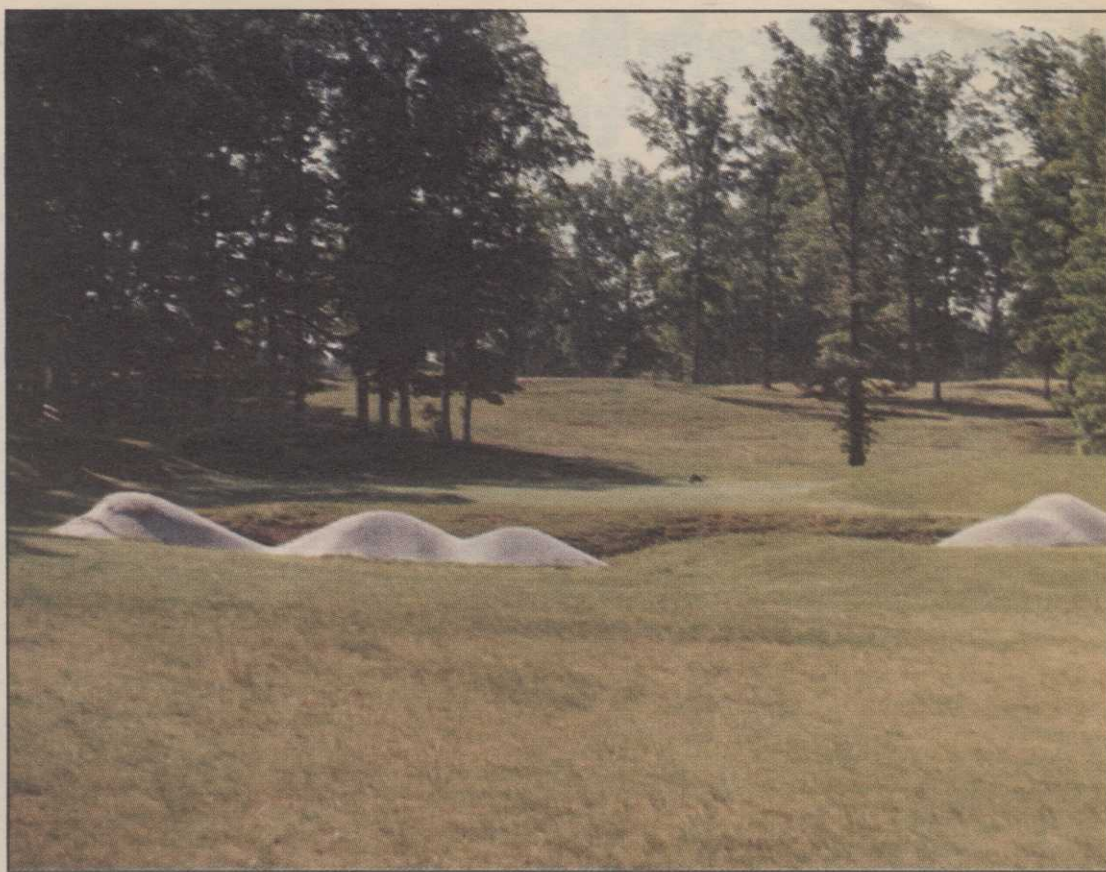
Montgomery Bell State Park in Tennessee.

In addition to that public course, Baird has completed the master plan for the restoration and reno-