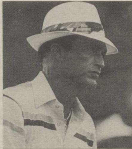
Chi Chi Rodriguez

1 p.m. — State government relations forum, presenting how superintendents and