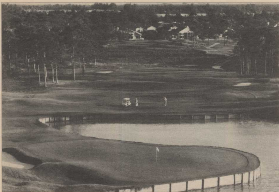
Harbour Ridge's 11th hole shows Pete and P.B. Dye handiwork in Stuart, Fla.