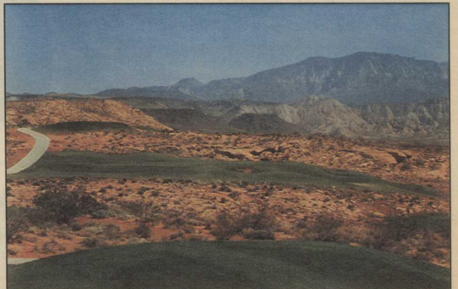
The view north from the tee of the par-3 8th hole at Washington Green Spring Golf Course in Washington, Utah, shows the contrast between red desert sandstone and golf turf that enhances a breathtaking view.