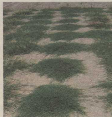
Note the uniformity of Putter plants in the center row as compared with the wide variants within competing varieties on either side of Putter.

The rich, dark, bluish-green color is irresistible to every golfer. With excellent turf vigor, fine-leaf texture and improved resistance to take-all patch disease, Putter is exciting news for golf course maintenance staffs. Quality features include a dwarf growth habit and high-shoot density. It's highly aggressive against Poa annua .