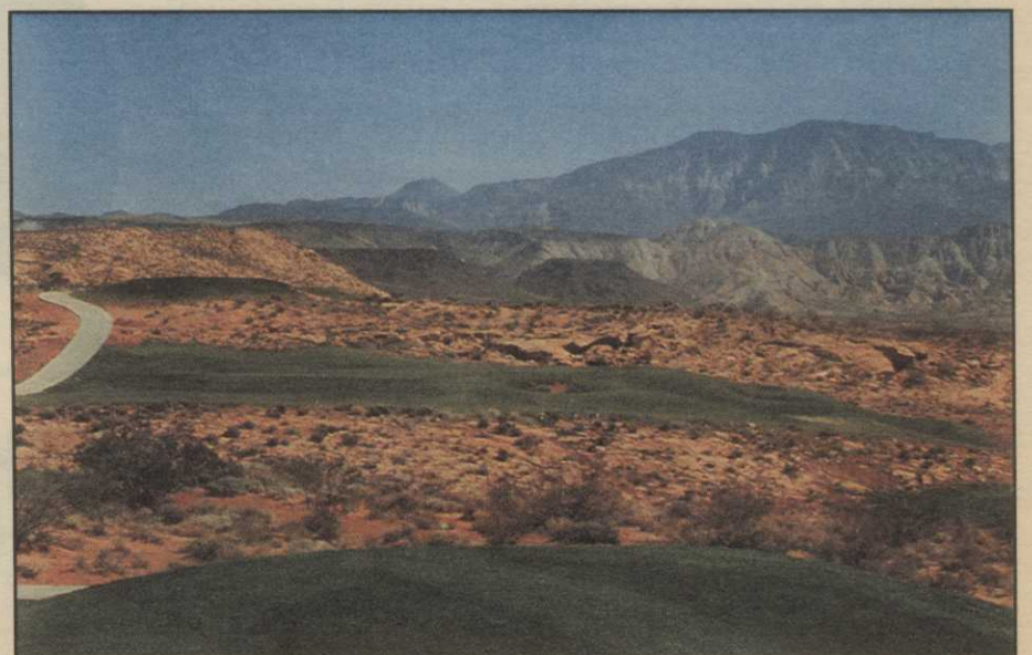
The view north from the tee of the par-3 8th hole at Washington Green Spring Golf Course in Washington, Utah, shows the contrast between red desert sandstone and golf turf that enhances a breathtaking view.