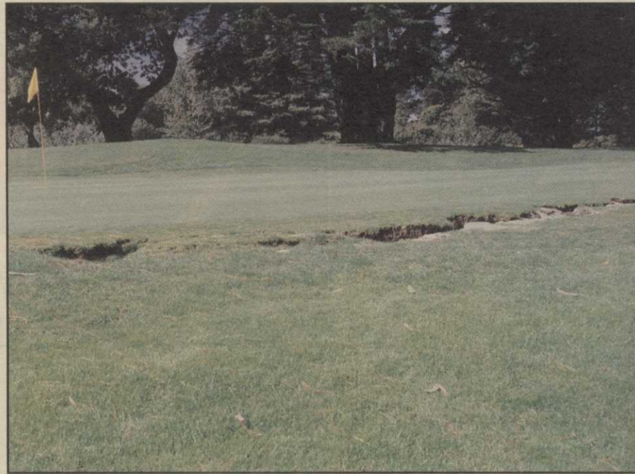
The Oct. 17 earthquake dropped DeLaveaga Golf Course's 18th green and collar eight inches along a 50-foot, four-inch crack.