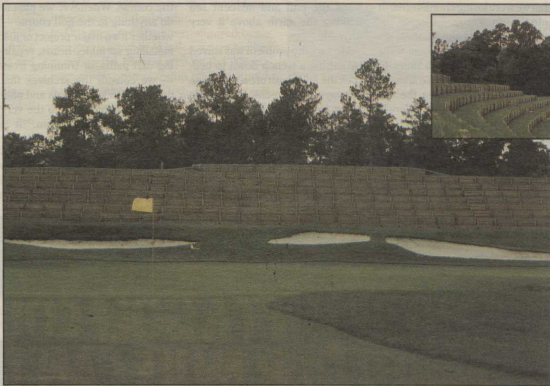
The stadium at Woodlands TPC in Houston, Texas, is a model for others.

Is this a riddle? Richard Luikens, superintendent at the Woodlands TPC and two other on-property courses, describes a need to add more "high drama" to the finishing hole, without touching a blade of grass on the hole itself.