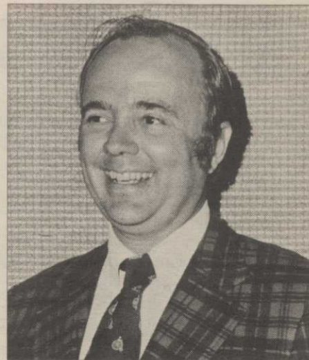
Robert Trent Jones Jr. will take over as president of the American Society of Golf Course Architects from Pete Dye at the President Dinner on April 5.

Those who will be voted upon for associate membership must have supervised construction of five regulation golf courses. If accepted, they will be associate members for three years and will have had to remain active designing courses during that time before becoming full members.