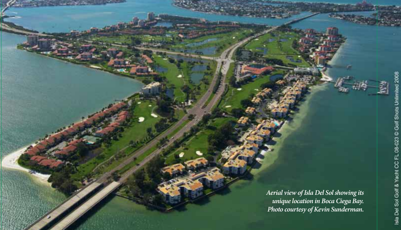
Aerial view of Isla Del Sol showing its unique location in Boca Ciega Bay.

Isla Del Sol Golf & Yacht CC FL 08-023