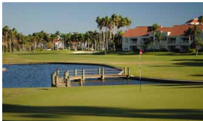
View of the 8th hole from behind the green. The walk bridge had to be rebuilt after Tropical Storm Debby flooded the course with 17 inches of rain.

In the late 1970s, the state of Florida dredged and filled some low, marshy areas in Boca Ciega Bay to provide some anchor points for the Pinellas Bayway complex to provide land access to the southern St. Petersburg Gulf beaches, Tierra Verde, Mullet Key and Ft. De Soto Park at the entrance to Tampa Bay. Isla Del Sol's front golf course is a great green space to balance the high-density housing, and each homeowner has either a golf course or a water view. The historic Don Cesar Hotel