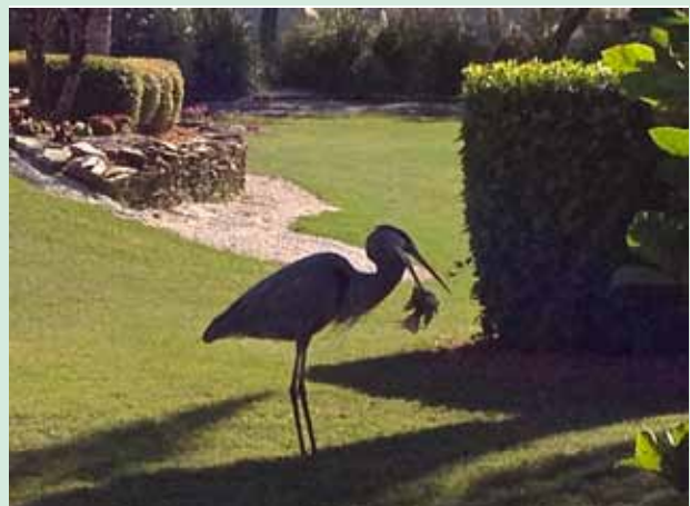
The early heron gets the fish!

My most amazing/lucky/important golf shot: My first hole-in-one. I was playing alone and had to shout at the group on the next tee to be witnesses and go look in the cup before I got to the green.