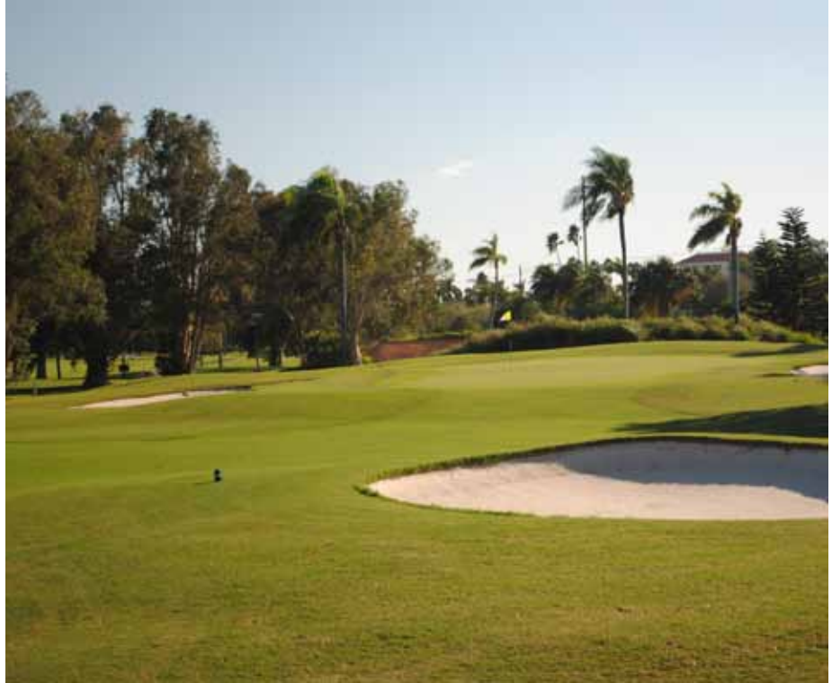
Accessible approach to the par 5, 540 yard, 4th hole.

The cultural programs at Isla Del Sol are in keeping with good stewardship practices most superintendents employ these days. Sunderman has a target of 2.5 pounds of N and 20 pounds of K per year on the greens. He makes four wall-to-wall, slow-release fertilizer applications per year on the rest of the course. The greens are double-aerified at 2x2-inch spacing twice in the spring and rolled and lightly verticut as often as possible. He uses 12 ounces of Primo per acre weekly in season. Chronic dry hot spots on the course