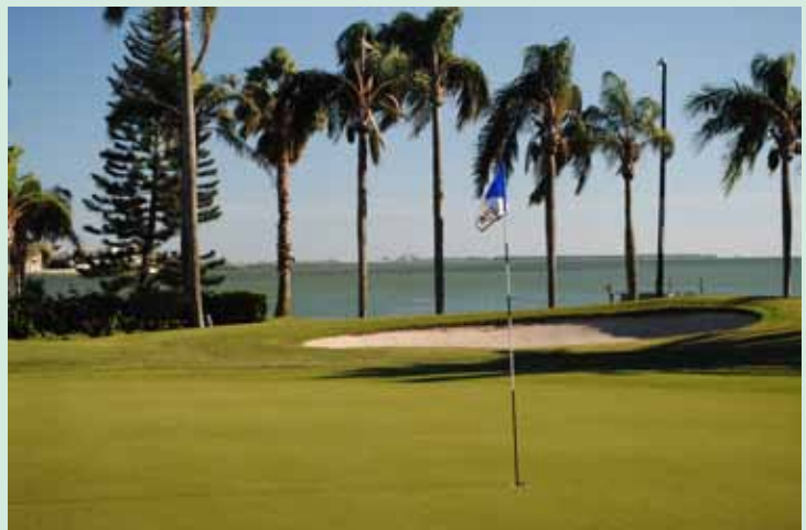
View from the 3rd Green includes the Sunshine Skyway Bridge and Boca Ciega Bay.