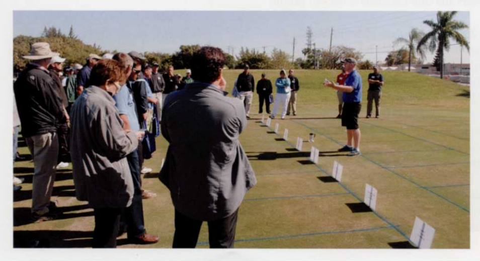
The Annual South Florida Turf Expo at the UF/IFAS station in Ft, Lauderdale drew a near-record crowd of over 400 people from all aspects of the turf industry. Featured sessions included research plot tours and updates, supplier products expo and demos, technician training sessions and classroom seminars.