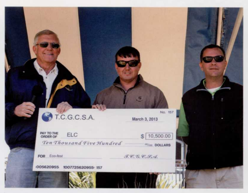
During the 2013 Blue Pearl Event at the Red Stick GC this past May, the Treasure Coast GCSA once again stepped up to demonstrate its local proactive environmental stewardship efforts by donating $10,500 to the Environmental Learning Center in Vero Beach.