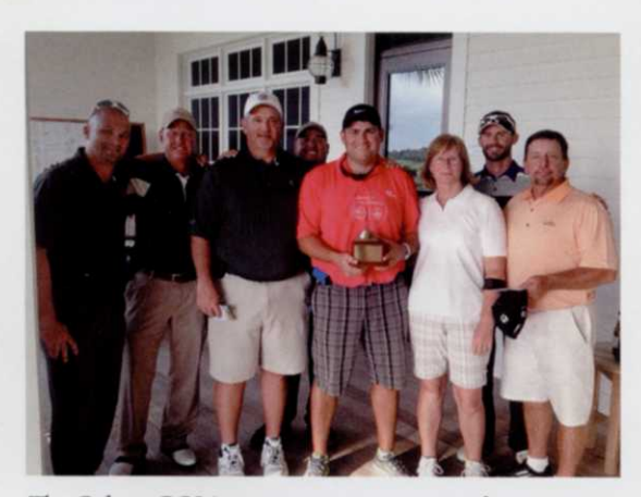
The Calusa GCSA team was victorious in the 2013 edition of the Calusa-Suncoast joint meeting golf match. Joint chapter meetings are one way for chapters to enhance superintendent participation.