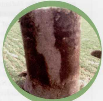
6" Maximus depth (See MaximusAeration.com)