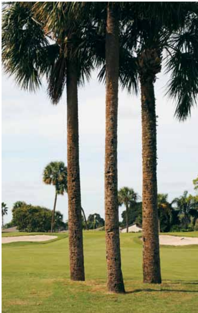
A trio of sabal palms and a pair of bunkers guard the first hole.