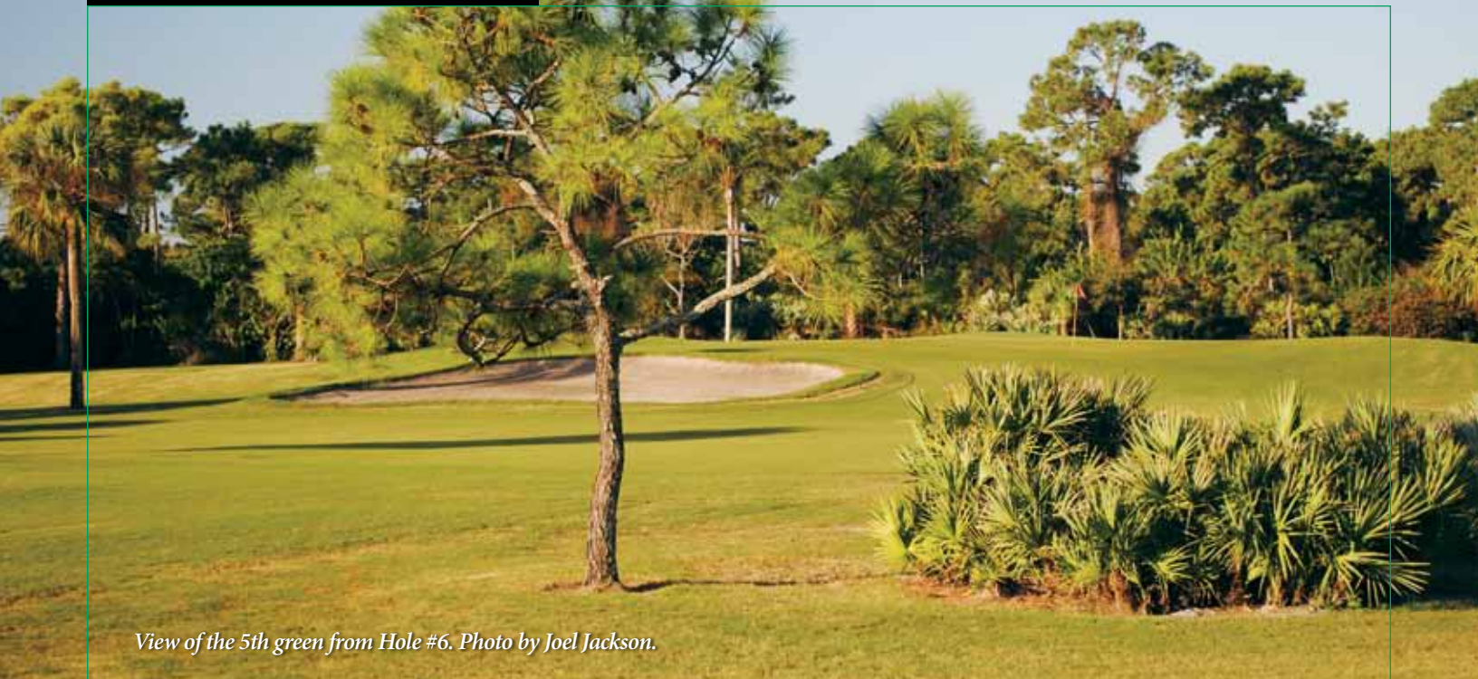
View of the 5th green from Hole #6.