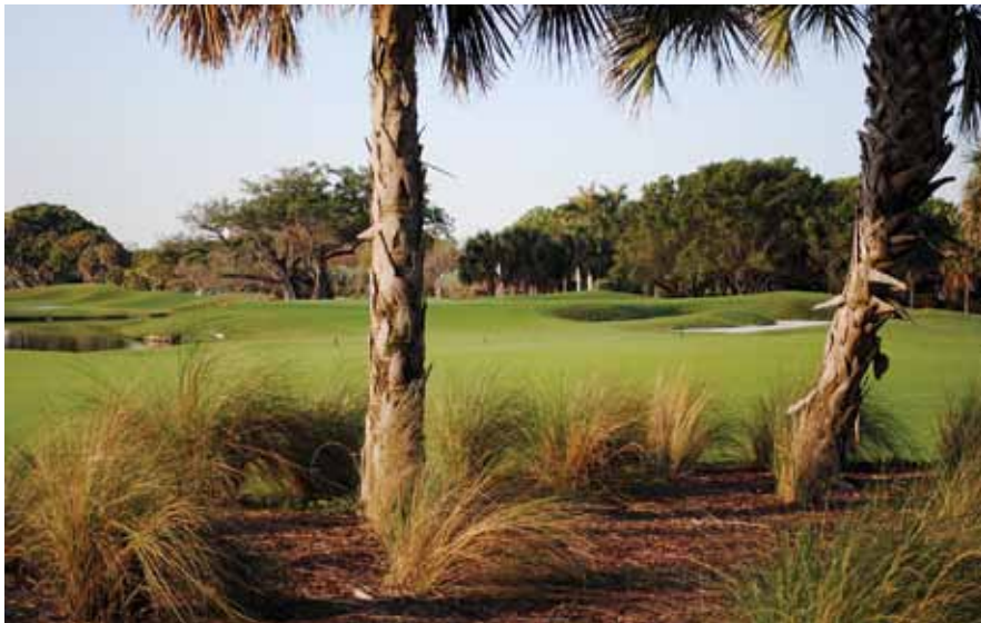
View of the 8th hole from one of many native areas on the course.

A couple of challenges Reeves faces with the conversion to paspalum is bermudagrass encroachment and maintaining healthy turf on the high side bunker edges. The bermuda encroachment in the far roughs is not much of a concern but some areas that are more in play have to be dealt with. Says Reeves, "Since we try to use as much brackish irrigation water as pos-