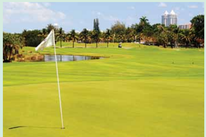
View from behind the 15th hole, a long dogleg par 5.