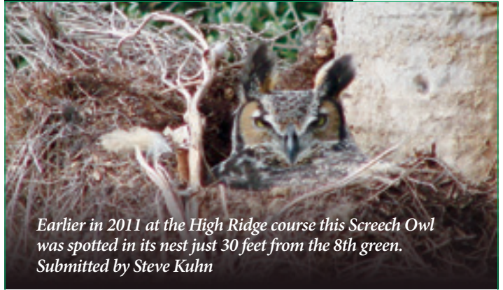
Earlier in 2011 at the High Ridge course this Screech Owl was spotted in its nest just 30 feet from the 8th green.