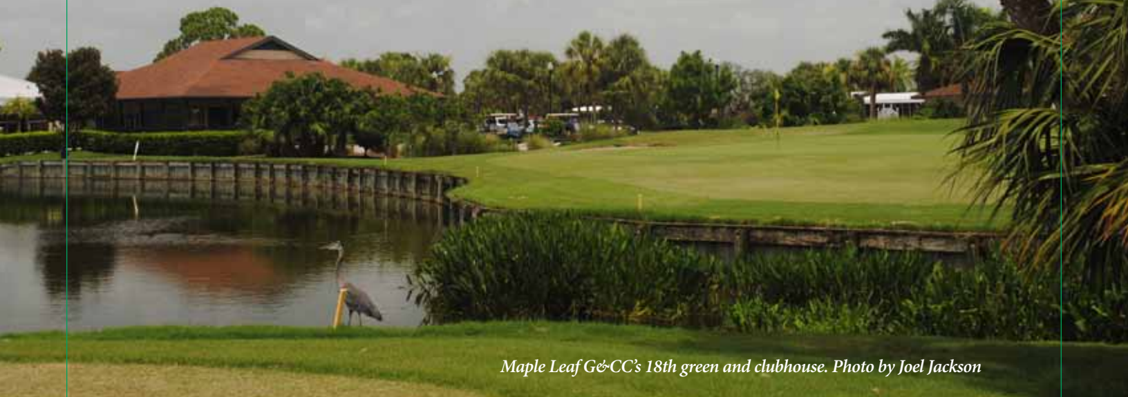
Maple Leaf G&CC's 18th green and clubhouse.