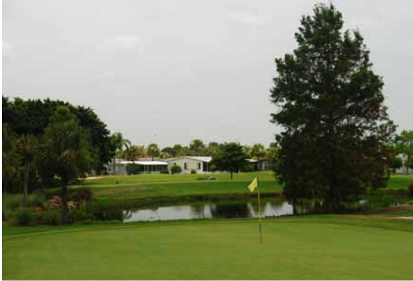
The golf course is the emerald jewel in the heart of the Maple Leaf community. View from the 7th green.

at SUNY — was aware of the increasing interest and numbers of women in the business, and his proactive awareness helped her development in the discipline.