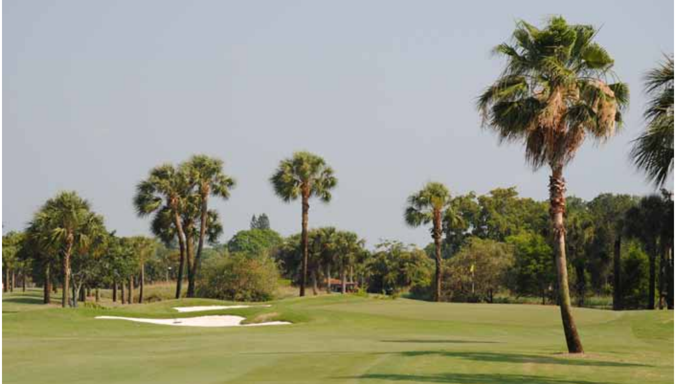
The open accessible 17th green is an example of the “ground game” course design.