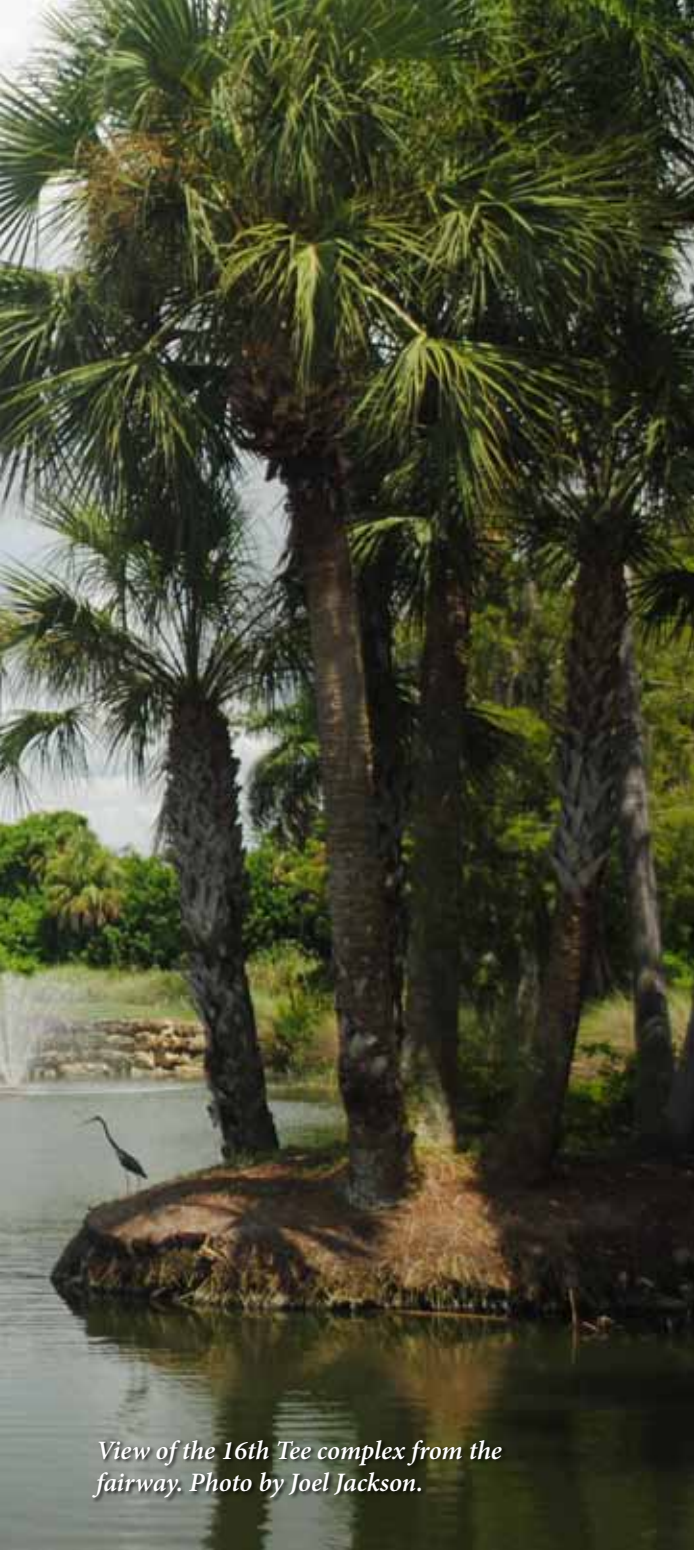
View of the 16th Tee complex from the fairway.