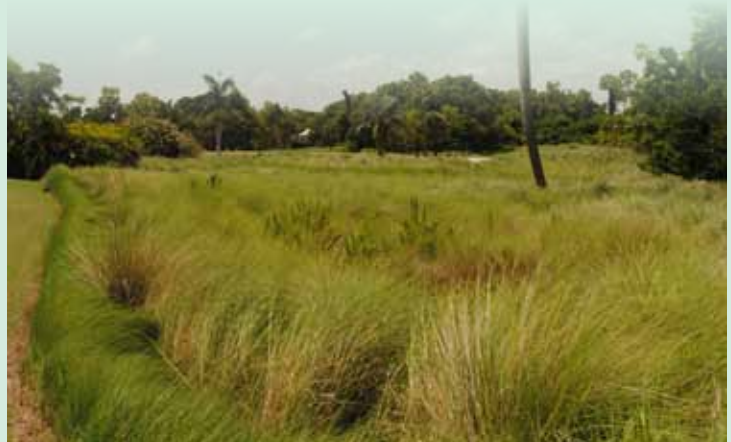
A natural area on the 13th hole.