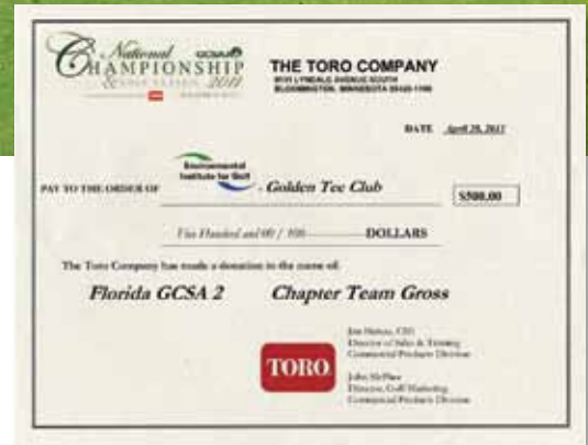
The Toro Company donated $500 to GCSAA's EIFG in the name of Florida's Golf Team.