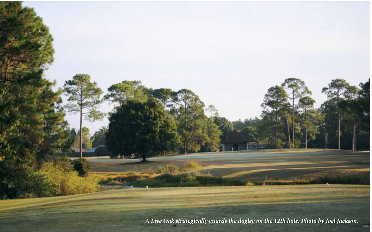
A Live Oak strategically guards the dogleg on the 12th hole.