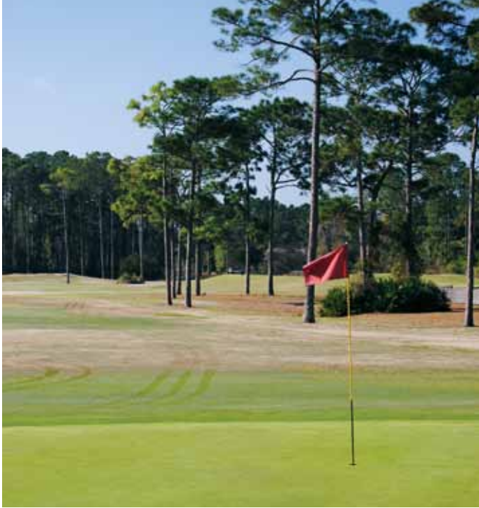
View from behind the par-4, 261-yard 15th hole.

the challenge with their game plan. Their stable of courses includes Cecil Field in Jacksonville, St. Augustine Shores, Grand Reserve in Bunnell, Wedgefield in east Orlando and Greystone in Nashville, Tenn.