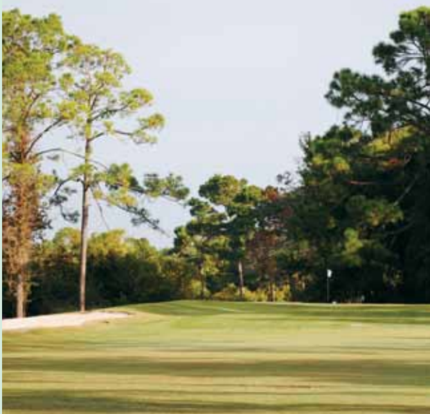
Mature pine woodlands frame many holes like the par-3, 5th hole.