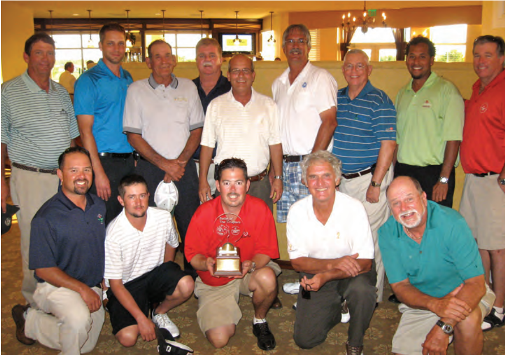
Camaraderie was the order of the day at the joint meeting of the Calusa and Suncoast chapters at The Plantation CC in Ft. Myers. This year the Suncoast won the Ryder Dup golf match.

was on hand to receive a $2,000 check to be distributed to worthy turf students.