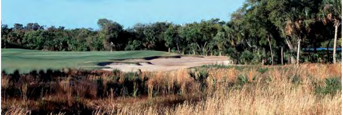
The par 3, 17th hole reflects the care taken to preserve the natural surroundings.