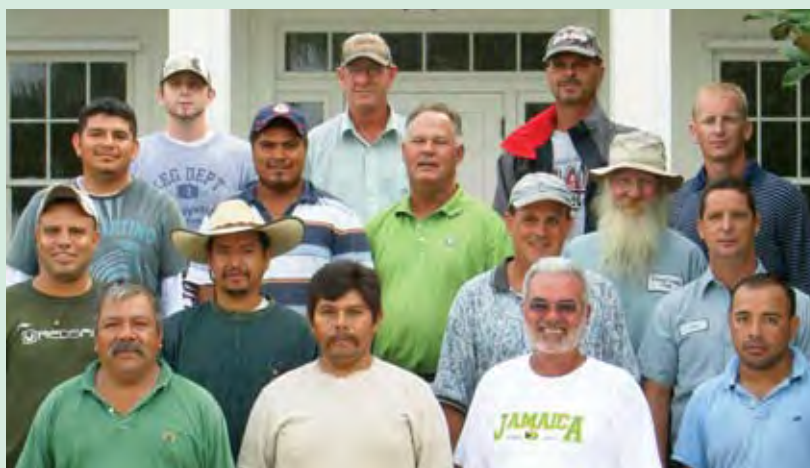
Coral Creek Club Maintenance Staff events.

Greens: 5A, avg. size 6,300 sq. ft.; TifEagle w/2A of Tifdwarf collars. HOC 0.80" (winter) to 0.97" (summer). No overseeding. Green-speed goal: 11–11.5 normal play, 12–13.5 special