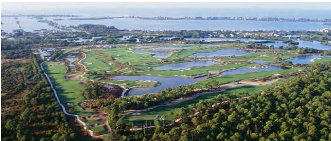
An aerial view reveals the close proximity of the course to Coral Creek, Gasparilla Sound and the Gulf of Mexico.