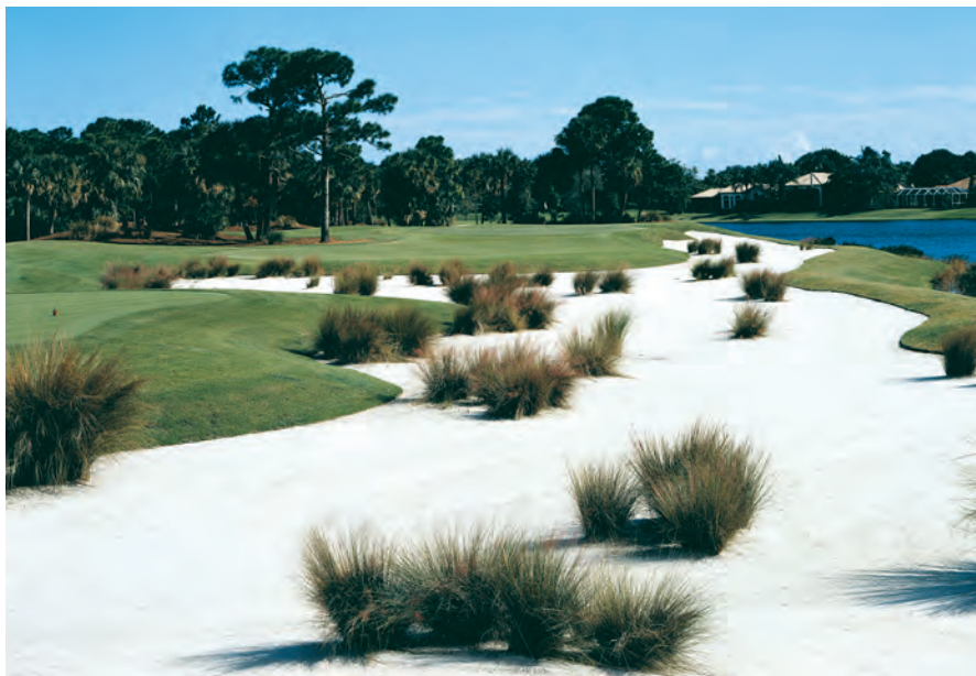
The use of sandy waste (transitional) bunkers and native grasses on the par-3, 12th hole was a proactive design change pioneered by Nicklaus and others in the 1980s to create dramatic views and protect the environment.