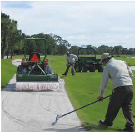
The Loxahatchee Club has pervious cart-paths made of concrete screenings. While they are considered a “low maintenance” item, they do require periodic maintenance and repair, especially after a very heavy rain.