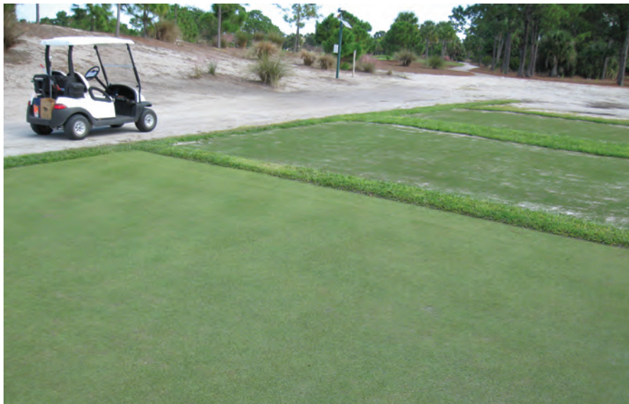
In the foreground is a nursery plot of seeded SeaSpray Paspalum being evaluated for possible use in the future. Newly planted TifEagle nursery greens are growing-in in the background.