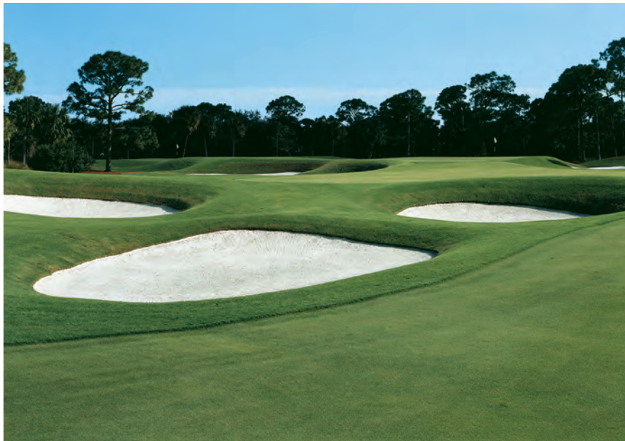
Some of that Scottish flair Nicklaus mentioned in his comments on the Loxahatchee design is evidenced by the double green serving the par-5, 13th hole and the par-4, 15th holes.

“I have to say that this was the start for me and being exposed to the Nicklaus organization at a young age really molded me. Their commitment