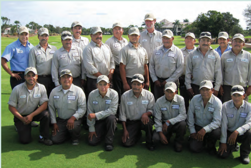
The Loxahatchee Club Golf Maintenance Team