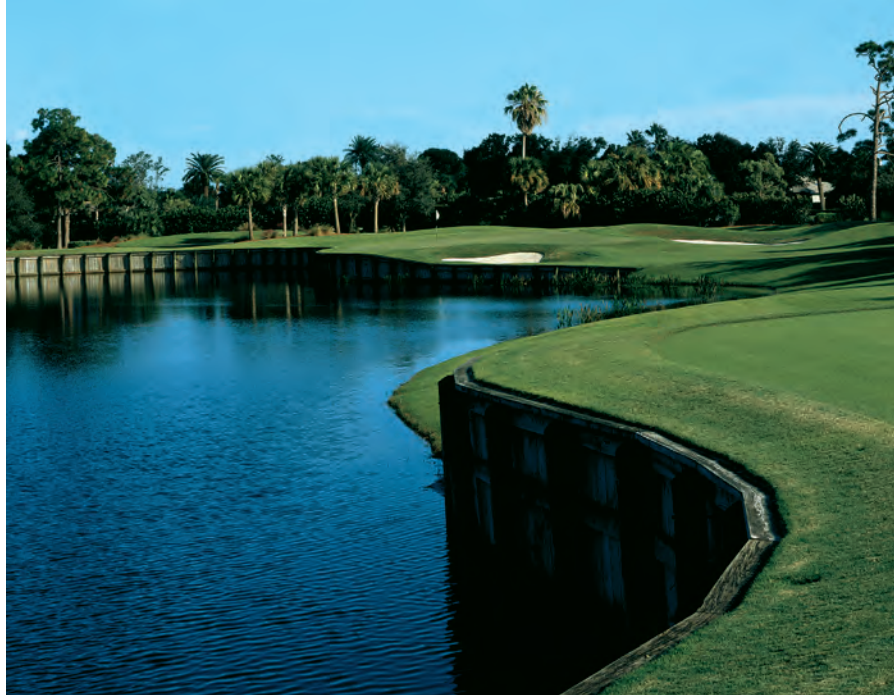
The par-3, 5th hole is guarded by one of 13 lakes on the course. Part circle heads, taller grass along the shore and aquatic plants guard the lake’s water quality.

“We make up our maintenance schedule a year in advance, so we can plan our turf maintenance needs around the club’s seasonal events,” Sprinkle said. “However, we are not a slave to the printed schedule. We keep