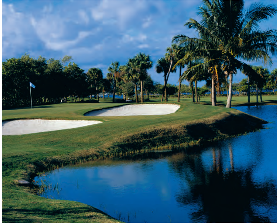
This lake guarding the par 3, 9th hole is part of a nine-lake, 5-acre network which stores stormwater and provides back up irrigation.