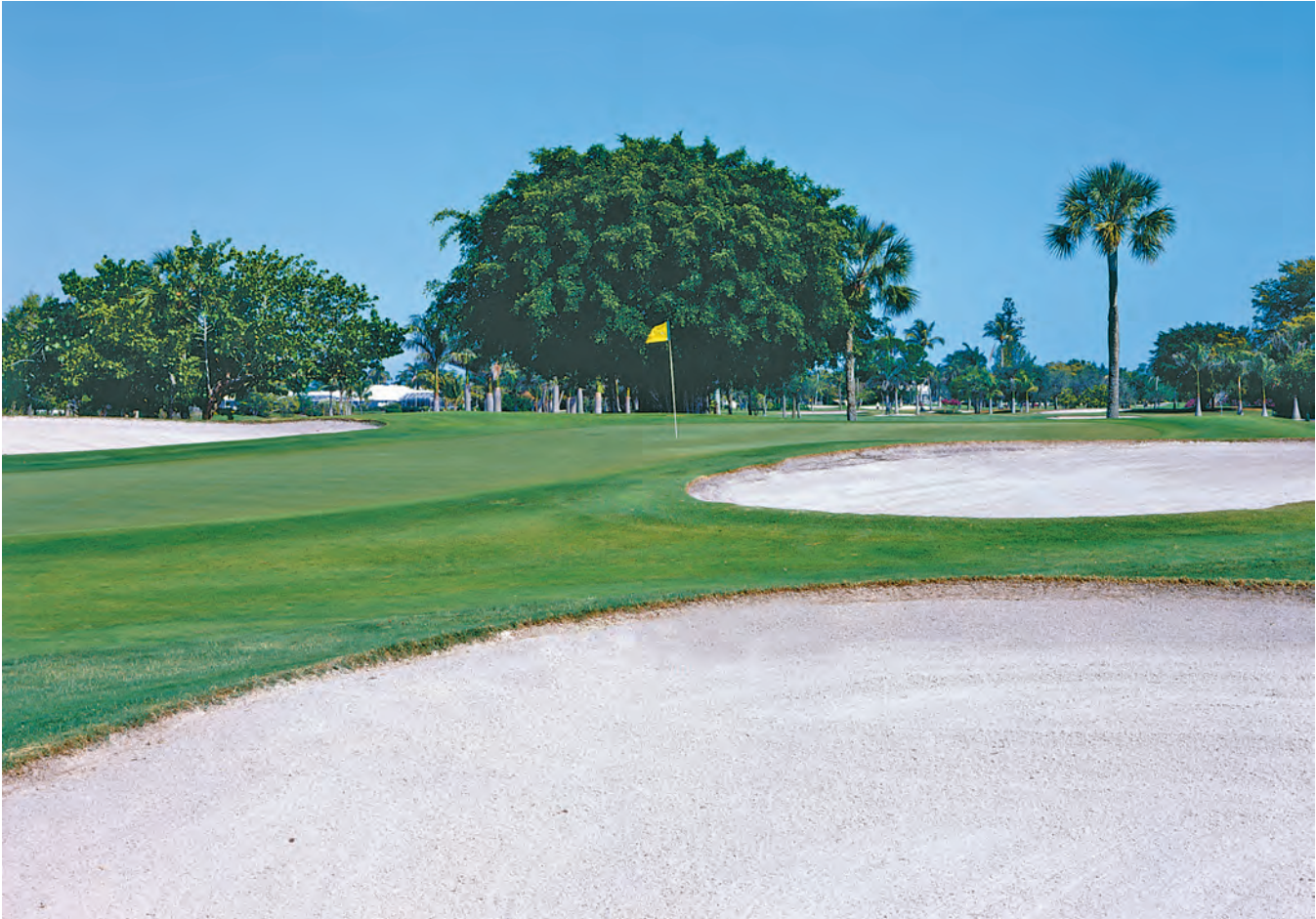
The 10th green and three of the 73 sand bunkers currently being dug out and resanded.

and managing an extensive tree inventory at only 2-1/2 to 3 feet above sea level has also been a challenge. Managing 4- to 5-foot mounds of straight sand can also be fun. Thankfully our effluent water has been of very good quality and the sandy soils are excellent for flushing