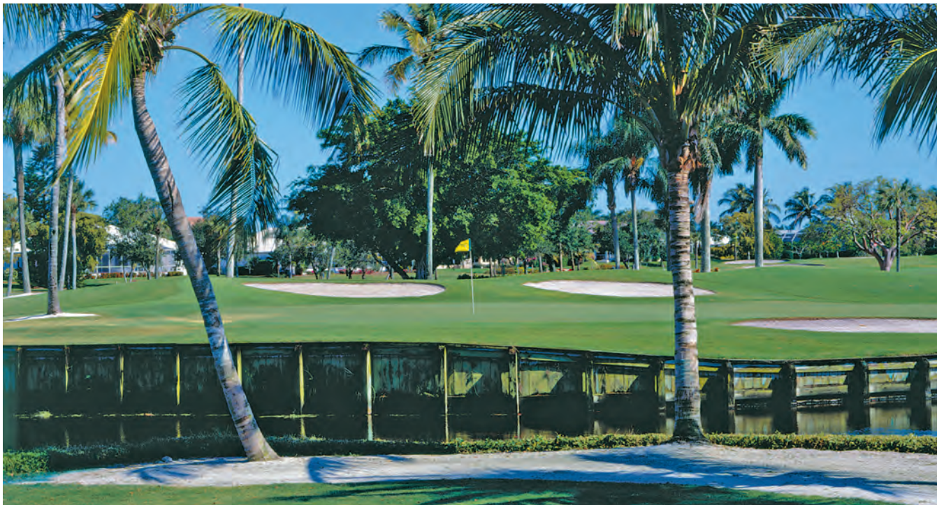
The 14th green in the background and in the foreground crushed rock screenings and wedelia ground cover form a buffer zone along the 12th tee.