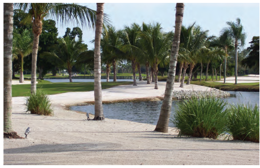
Crushed rock beach areas reduce irrigated turf acreage and provide buffers around water bodies.

The Deltona Corporation developed the island back in the 1960s and built the original club called the Marco Island Country Club, designed by Dave Wallace and opened in 1966. When the members bought the club in 1986 it was renamed the Island CC and in 1992 Dean Refram renovated the greens