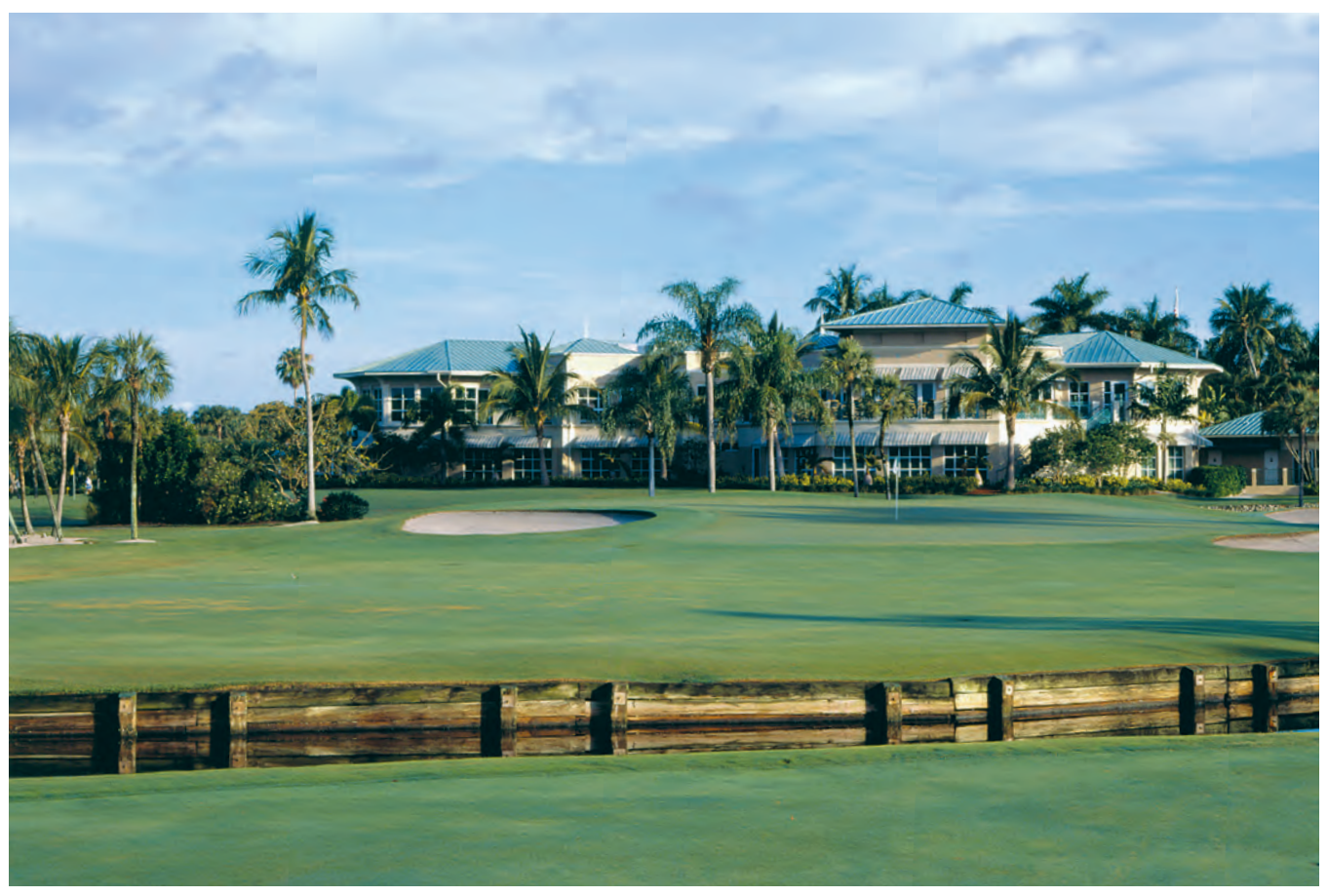
View of the 18th hole and the Island CC clubhouse which was renovated in 2005.