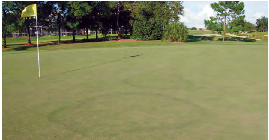
Fairy Ring disease outbreaks are common on putting surfaces.

Our overall fungicide program has remained about the same over the past few years and we have seen more pythium activity. Those greens maintained with a higher cut did better than those stressed with a lower cut.