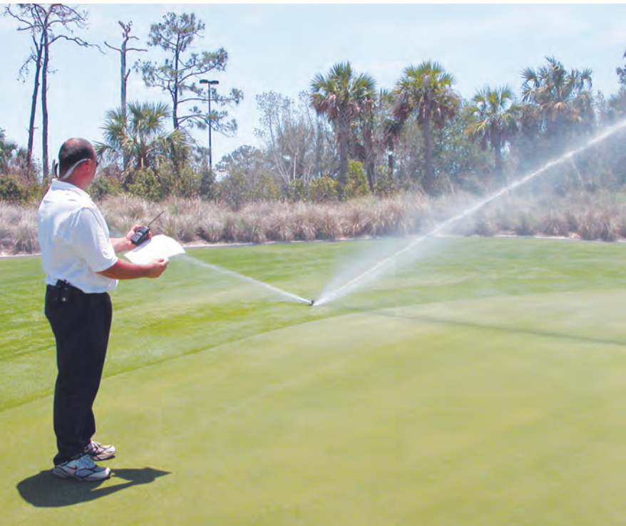
Golf course irrigation is professionally managed and only consumes around 3 percent of the fresh water used annually in Florida.