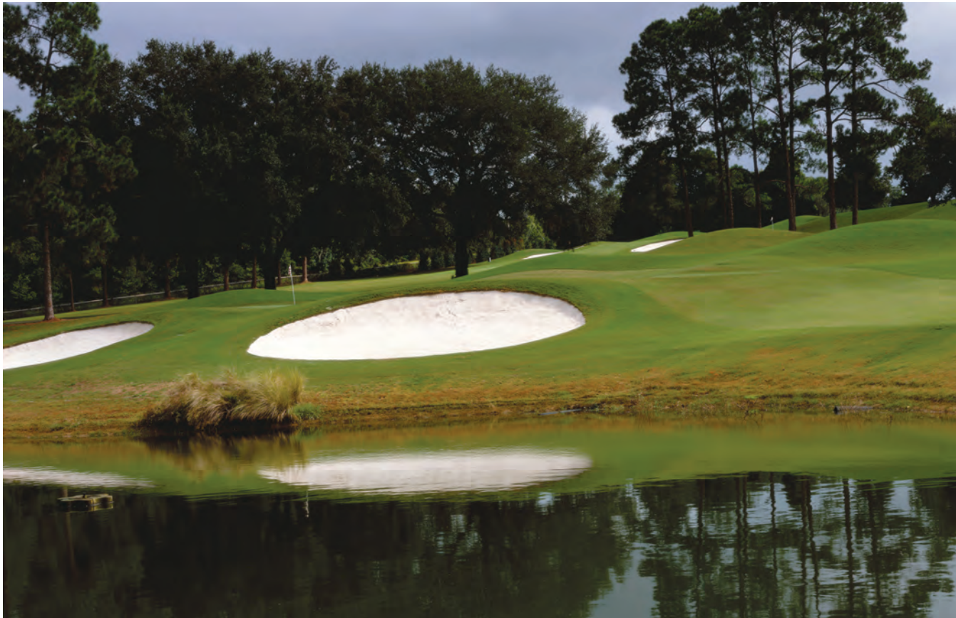
There isn't much water on the course, but an acre's worth challenges approach shots to the 416 yard, 14th hole.

at any golf course in the state, and the new golf car fleet even comes equipped with GPS units. There is a separate teaching/practice building with roll-up doors and the latest swing analysis equipment so FSU golf team members and golf program students can practice and learn during inclement weather.