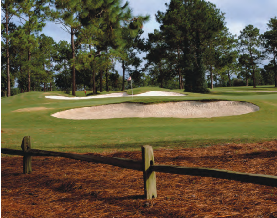
A split rail fence and pine straw area borders the cart path down the left side of the 168-yard, 8th hole.