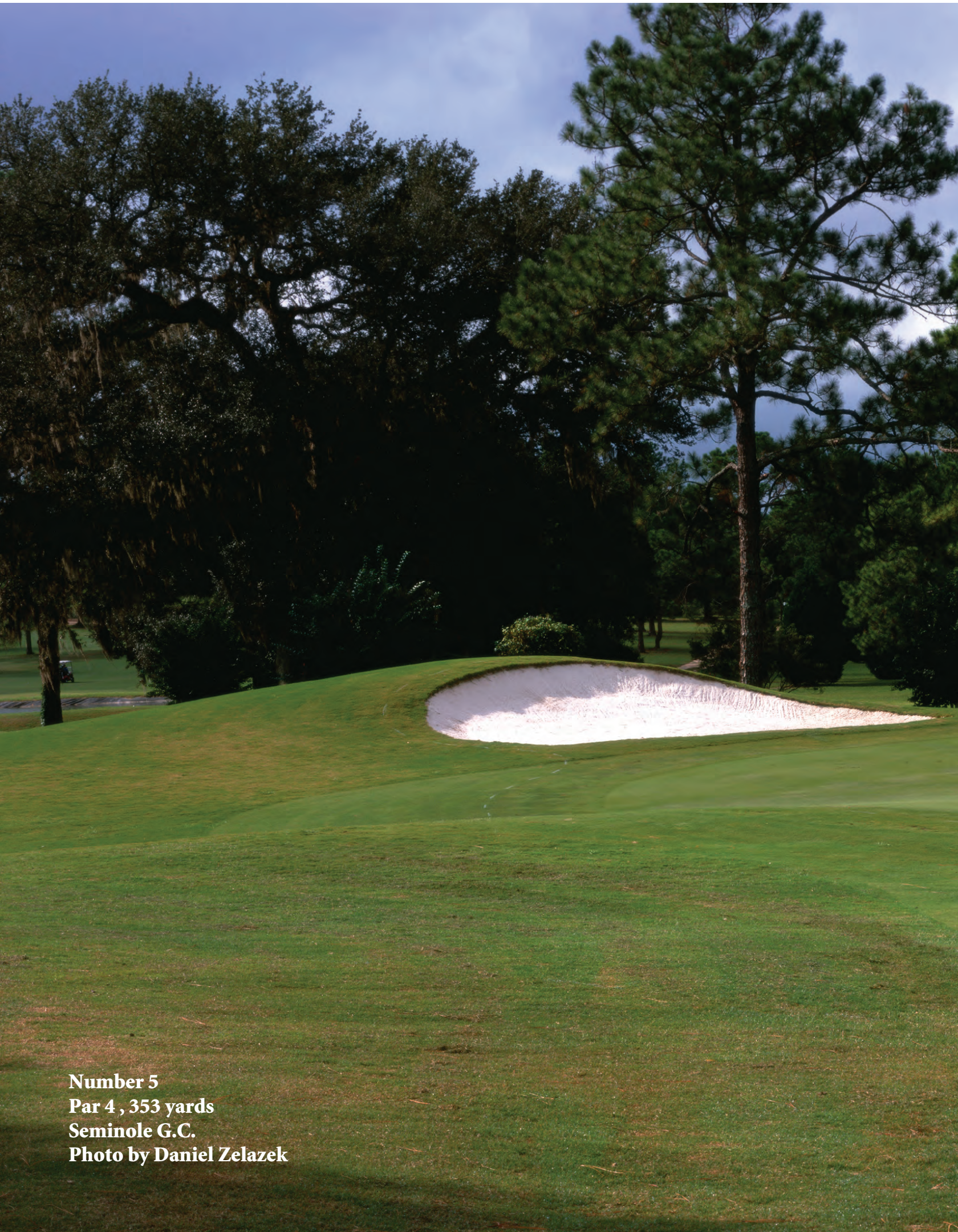
Number 5 Par 4 , 353 yards Seminole G.C.