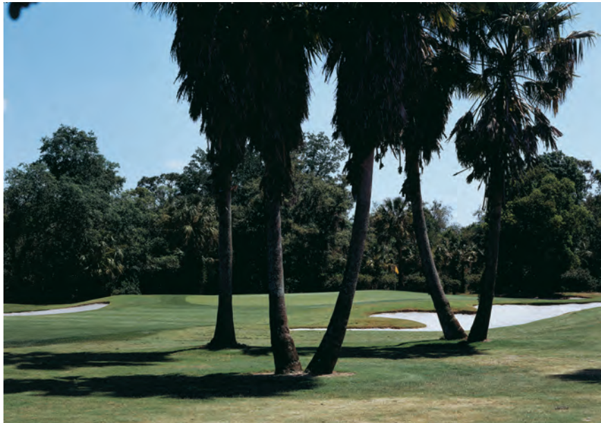
Palms and oak trees surround the green on the Par 5, 558 yard, 13th hole.

Jensen Beach, Florida 772-692-1221 cell: 772-215-1819