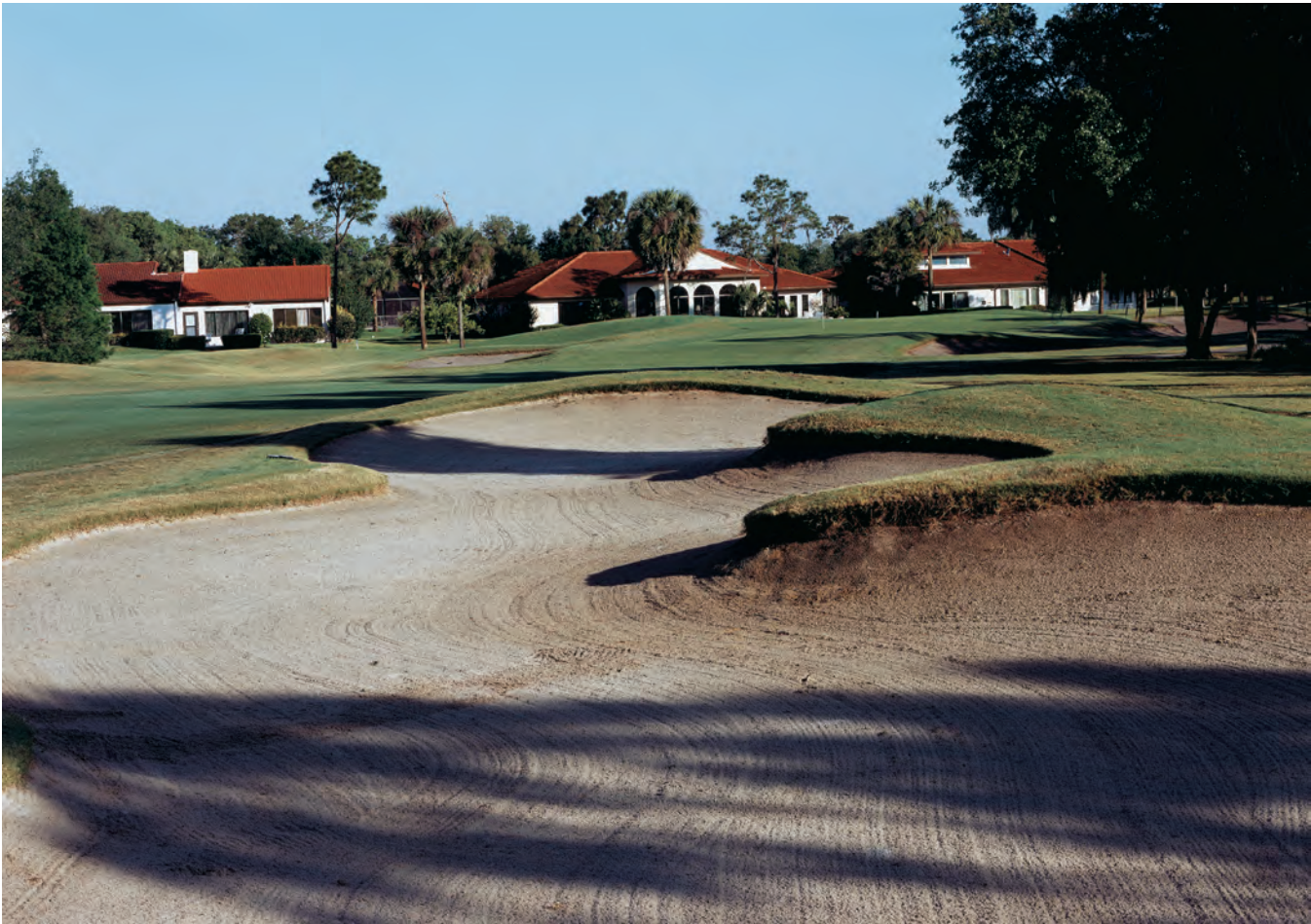
Resident villas and early morning shadows highlight the first hole at the Lake Wales Country Club.

Straightforward, good basic programs, but what makes them really work efficiently are the relationships from top to bottom