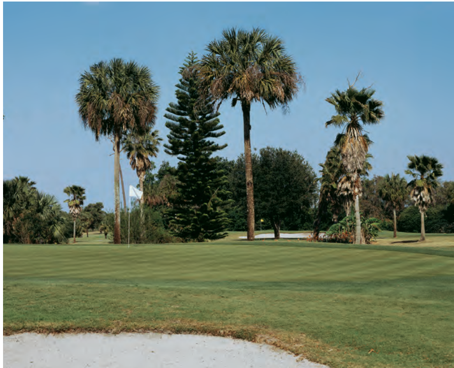
A view of the 17th green with the 10th hole in the background.