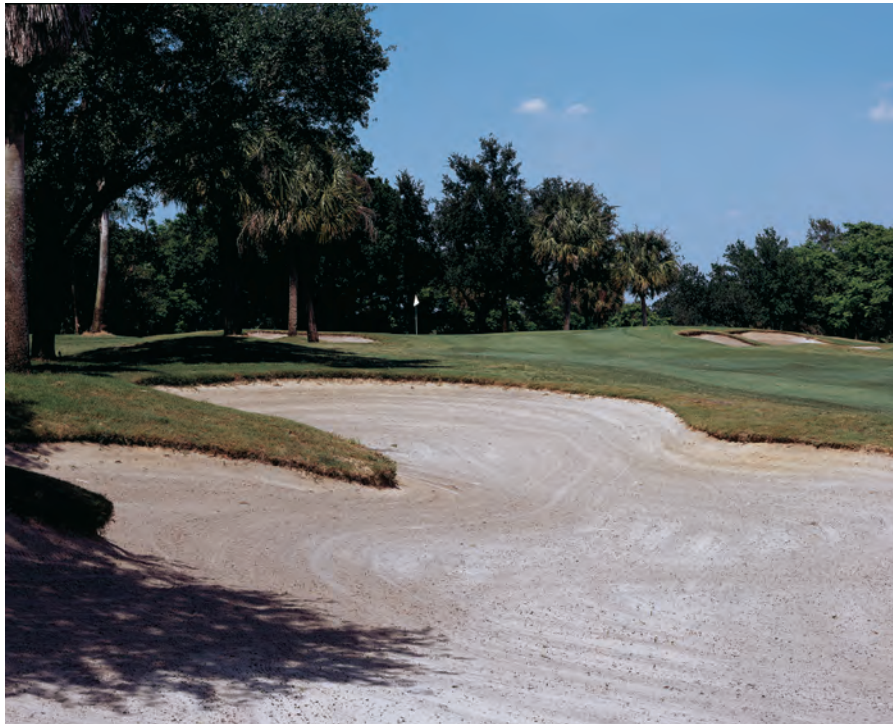
The native sand bunkers on the par-4, 6th hole and the rest of the course drains so well that play can resume in 30 minutes after a heavy rain.

"I also took up competitive TKD up until 2002 when I won a gold medal in sparring and a silver medal in forms at a state tournament. But my most anxious and nerve-wracking experience in TKD was last April when I flew to Bloomington, Illinois to test for my 4th degree black belt and being judged by