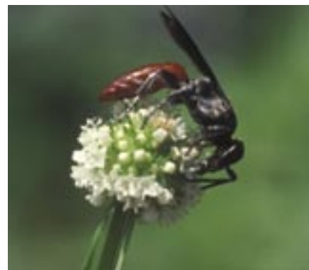
Larra wasp on Larraflower.

Some have suggested a name change to Southern Larraflower for the wasp’s