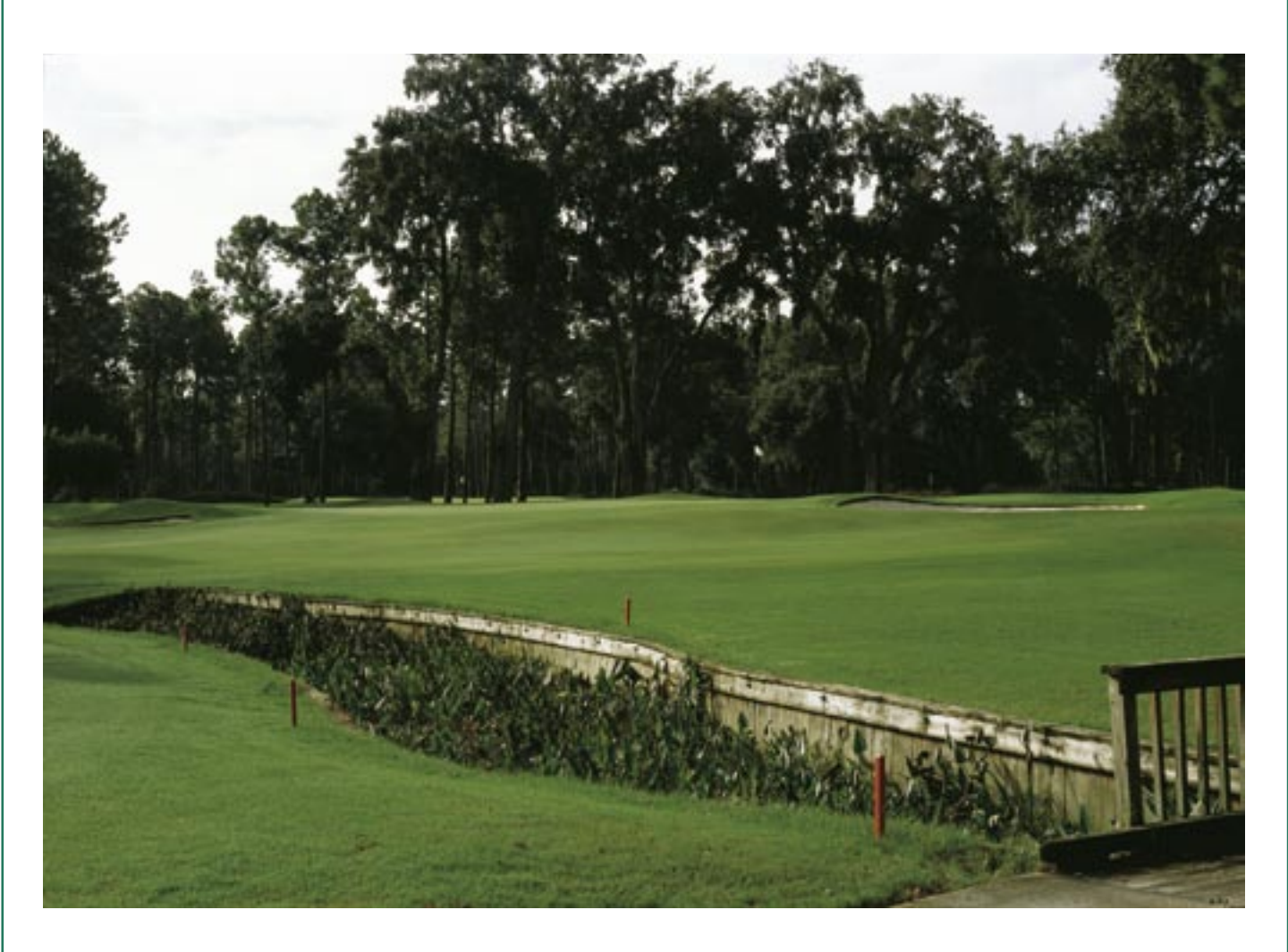
The sun shines on the 422-yard, second hole and in the spring the aquatic plants in the water hazard will bloom and add a splash of color to the scene.

decides to go "ultra," MiniVerde is the leading candidate. Neff has been running a side-by-side comparison with TifEagle and MiniVerde on the practice-area chipping/putting green. Neff said, "I have told our spray tech not to automatically clean up the green or give them any extra TLC. I want to see what happens to both grasses – how they handle stresses, etc."