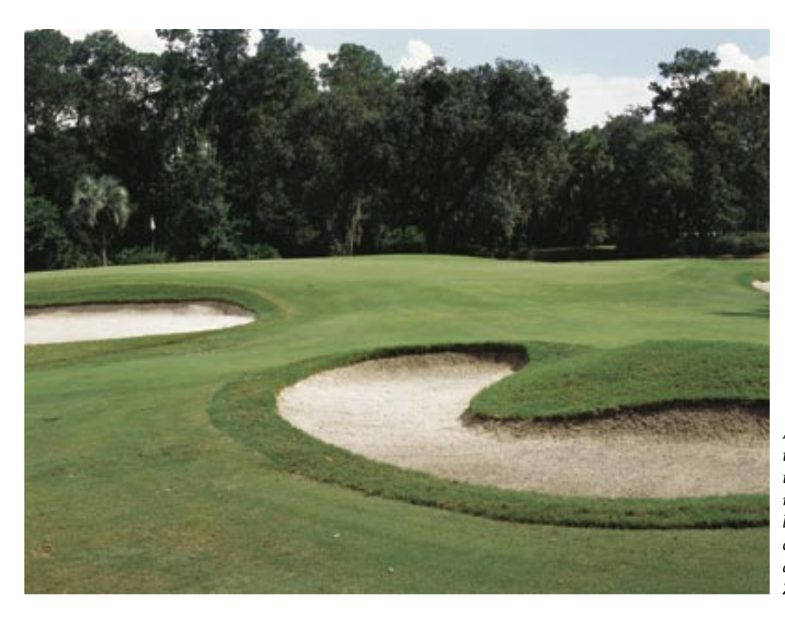
Ancient oaks and towering pines frame the par-3, 8th hole, reflecting the parkland look and feel of a classic Donald Ross design.