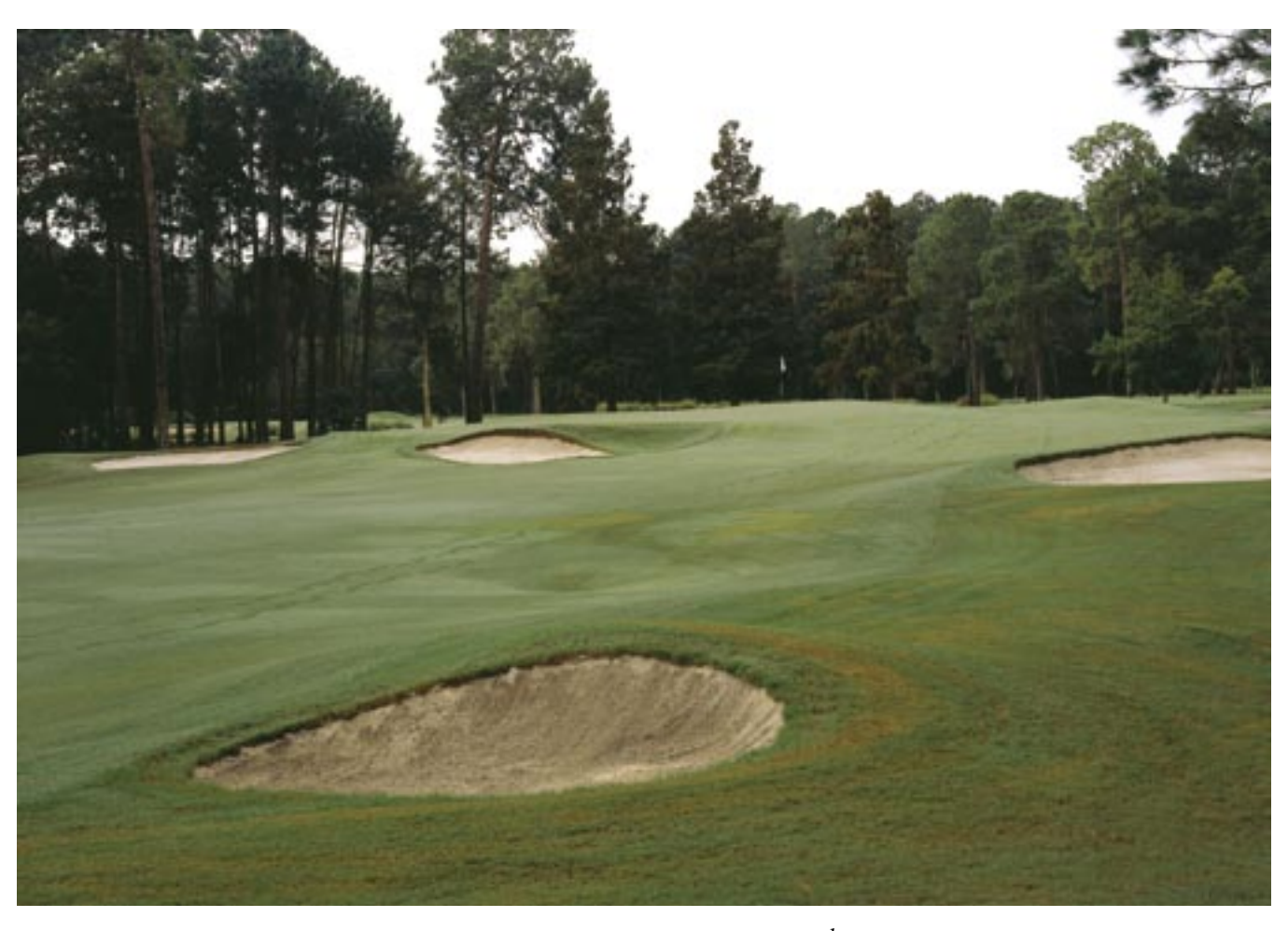
A gray dawn breaks on the 503 yard, 4<sup>th</sup> hole. Footprints in the dew indicate golf course maintenance has already been here setting up the course.

The next big decision the club made was to allow Neff to begin a long range tree- and shade-management program... huge areas of the roughs and fairway were thin, weed-infested areas with black scaly algae patches. The trees formed a solid wall blocking out sunlight and air movement.