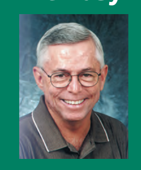
GREEN SIDE UP By Joel Jackson

Well, it may not be easy for a flannel frog puppet in a static-cling world, but it doesn't have to be difficult either. Given the political climate we are living in right now, Muppets and turf managers need to throw some fabric- and opinion-softener into the media machine.