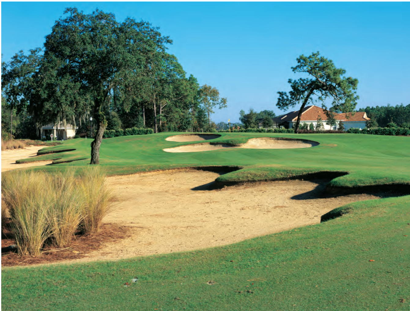
Oaks, pines and bunkers accent the 543-yard, par-5 14th hole.