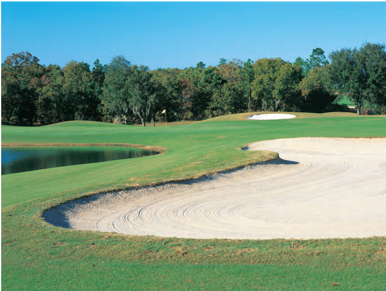
Close-up of the par-5, 10th hole showing the hardwood forest that borders the course.

also a big fan of using Primo, especially during the summer on fairways to keep the turf dense and reduce the amount of clippings.