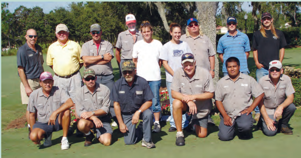
Skyview Maintenance Staff