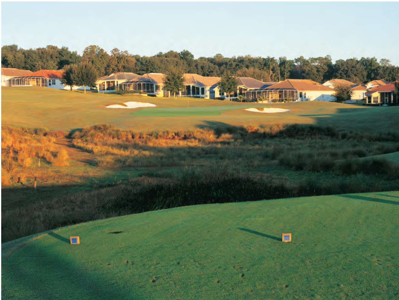
A large, native-grass stormwater retention area separates the tee and green on the 208-yard, par 3, 5th hole.

be around good people on and off the golf course to have a positive outlook in general. We can't always choose the people we have to work with, but we can choose how we treat each other."