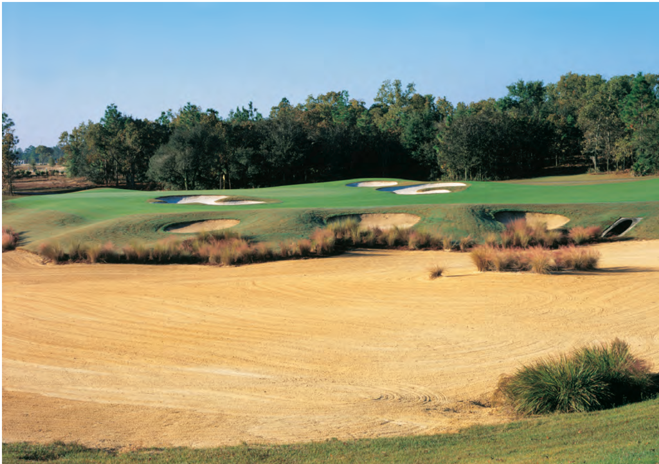
Hole No. 13, 181- yard, par 3. There are 40 acres of native sand “waste” bunkers on the course.