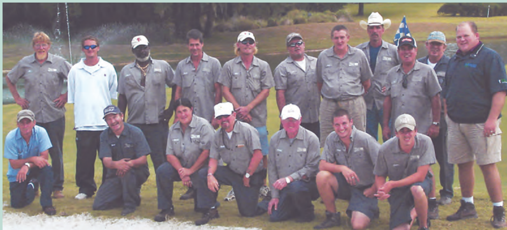
Meadows and Oaks Staff

Property: Total acres, 720; 410 under maintenance (100 acres each Meadows and Oaks, 210 acres Skyview).