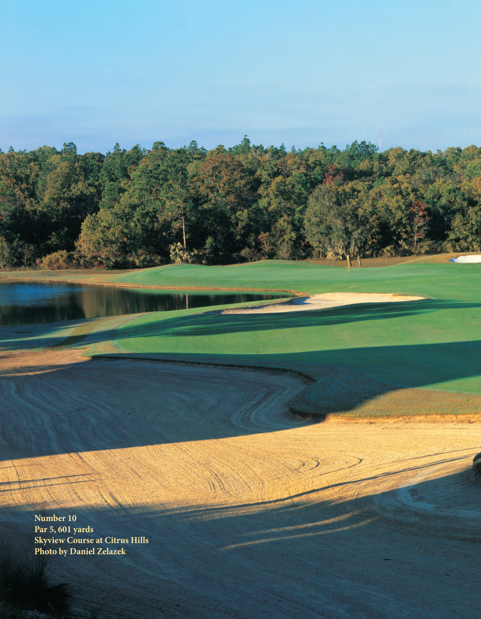
Number 10 Par 5, 601 yards Skyview Course at Citrus Hills