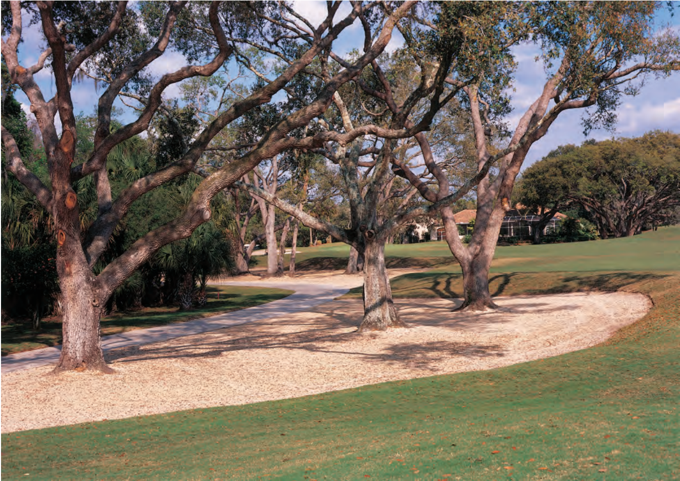
This dogleg on No. 10 East shows one of the 12 crushed-coquina native areas that take several acres of turfgrass out of maintenance, thus reducing required inputs.

Laurel Oak is a community asset in so many ways ... and yet there is one more: The Laurel Oak Cup. This special event held each year, usually in September, raises money for the Special Olympics.