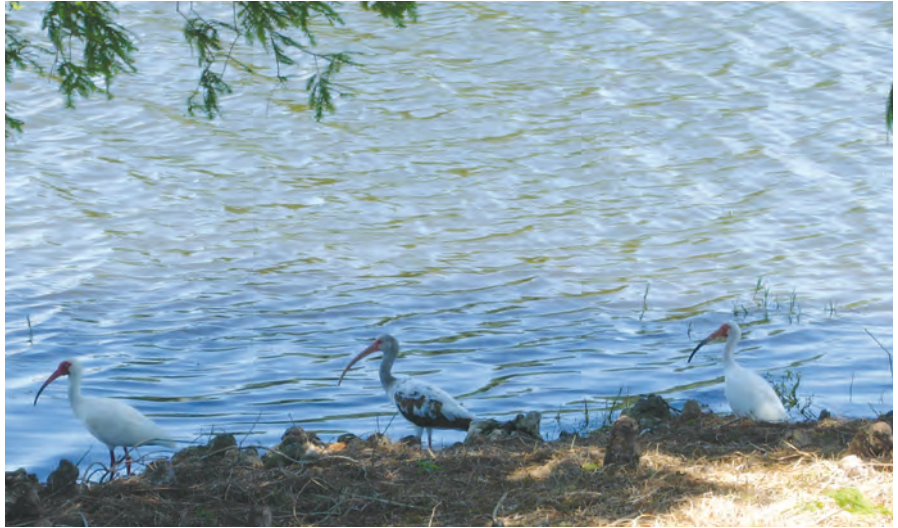
White ibis, two adults and one juvenile (center) rest in the shade of bald cypress trees.

Laurel Oak is awaiting final certification in the Audubon Cooperative Sanctuary Program. The fauna list includes otters, fox, deer, rabbits, squirrels, songbirds, wading birds, hawks, migrating white pelicans, softshelled turtles, a few alligators and an occasional visiting bald eagle.