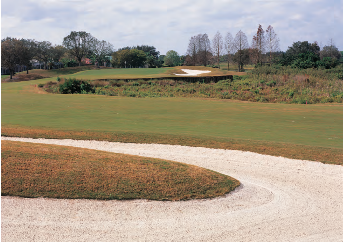
At 582 yards, No.17 West is the longest of all the par-5 holes. The shot to the green is guarded by a native wetland.

Daily morning crew meetings and assignments coordinate the maintenance routine with club functions while enabling maximum turf care. Additionally Wright attends weekly manager meetings and monthly green committee meetings.