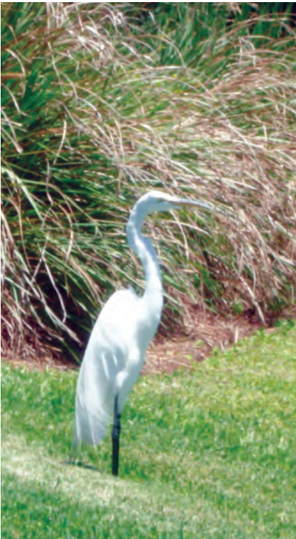
A Great White Heron stands vigil watching for his next dinner.