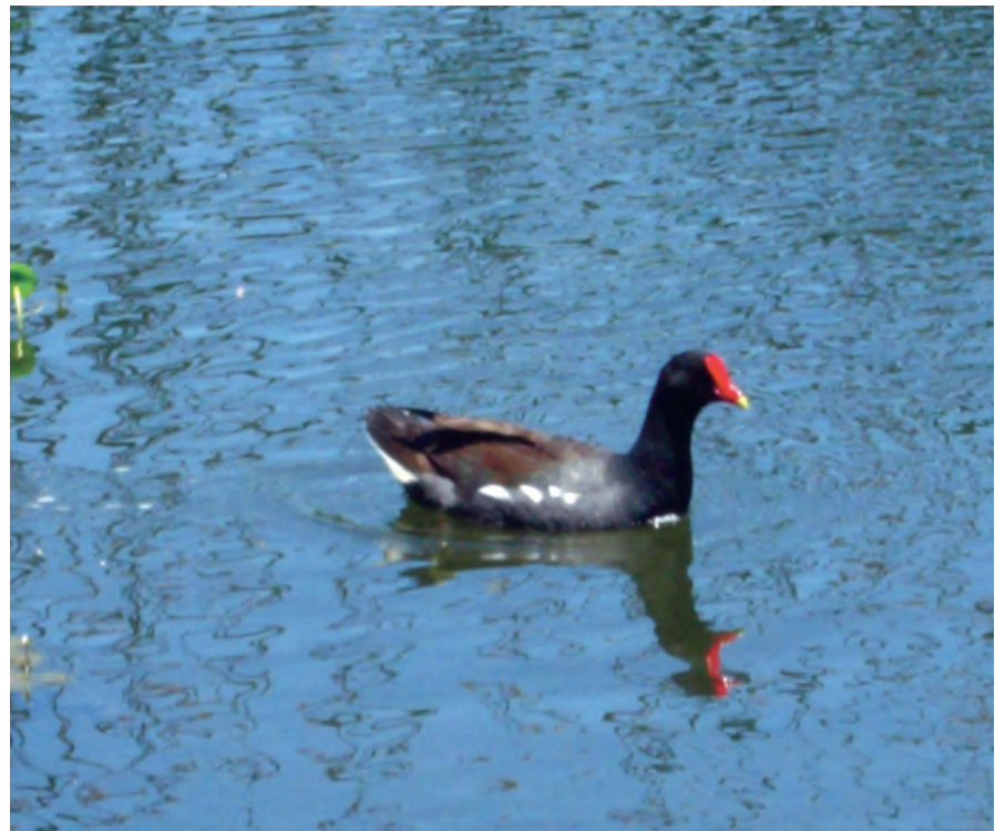
Water birds like the moorhen, above, forage for food around the aquatic plants in golf course lakes.