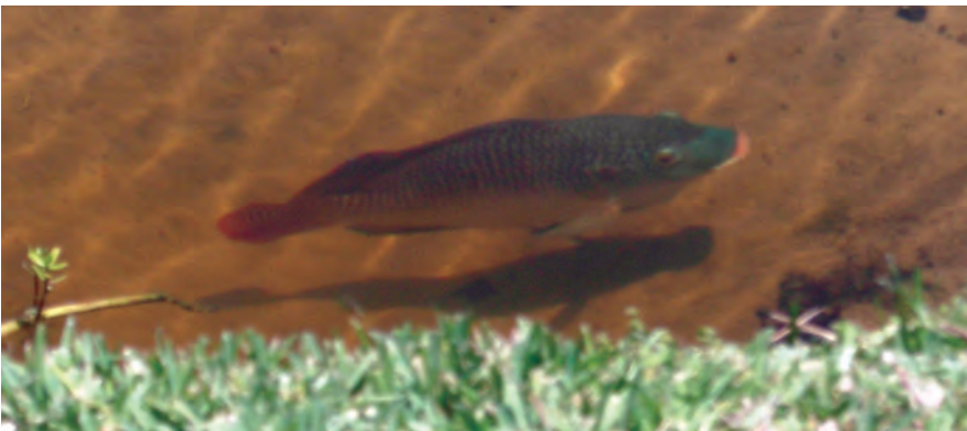
Clear golf course lake water reveals female tilapia, left, guarding her sandy nest along the shoreline.