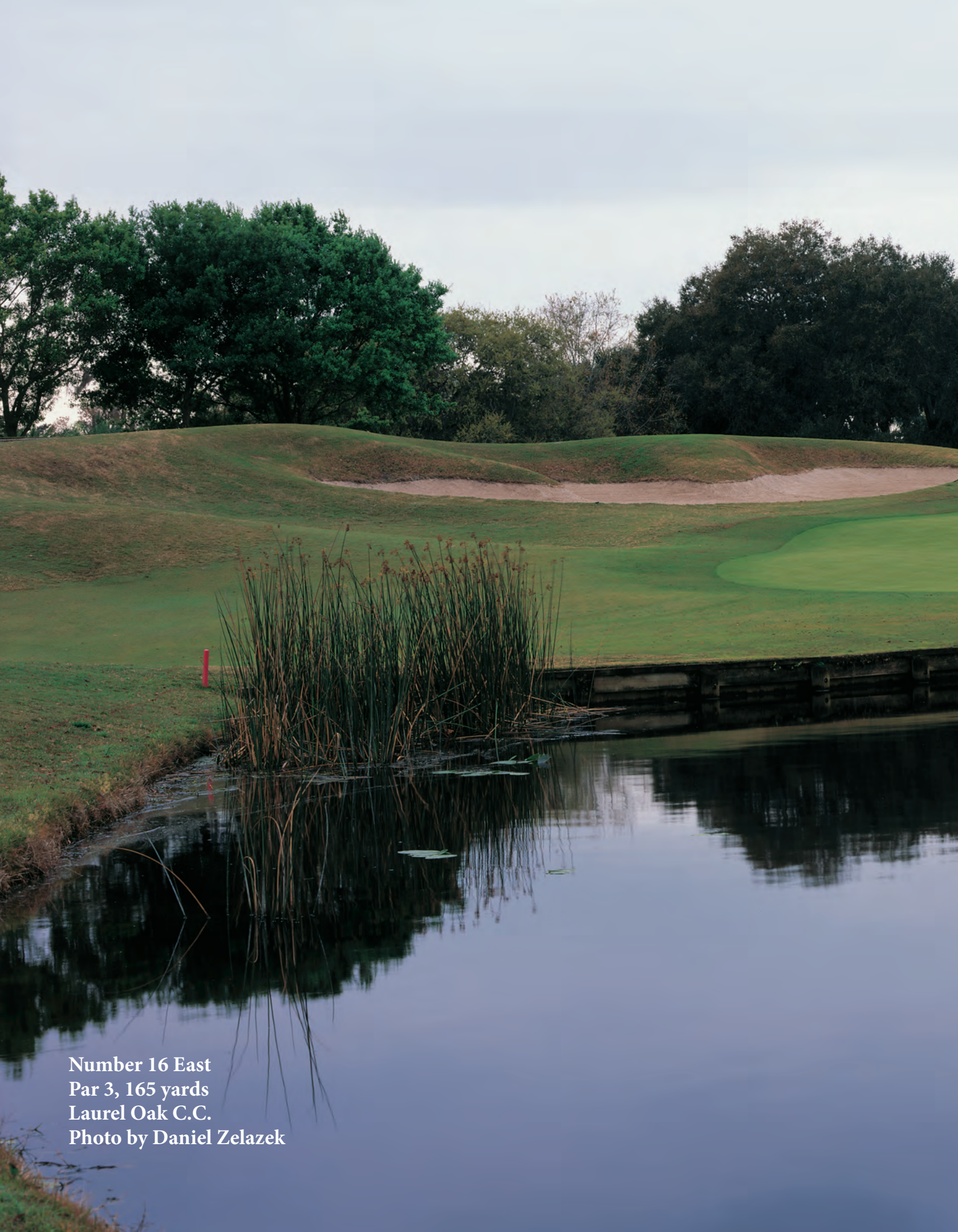
Number 16 East Par 3, 165 yards Laurel Oak C.C.