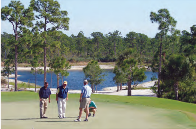
A shot of some of the players enjoying The Blue Pearl's new venue this year, the McArthur G.C. on May 8 in Hobe Sound.