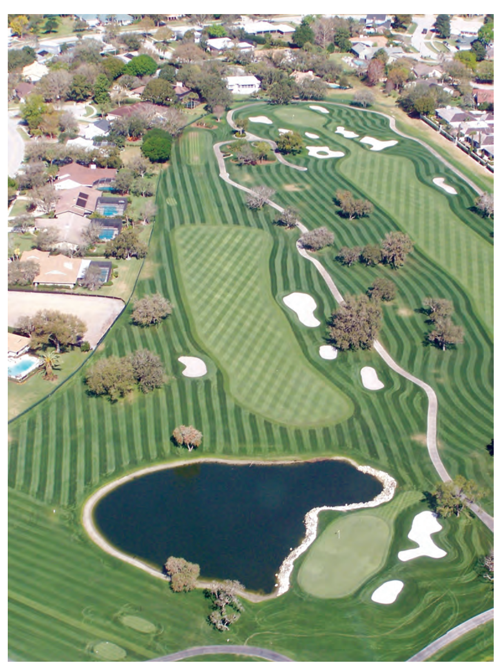
Aerial View of the 12th and 13th holes at Bay Hill during the Arnold Palmer Invitational.