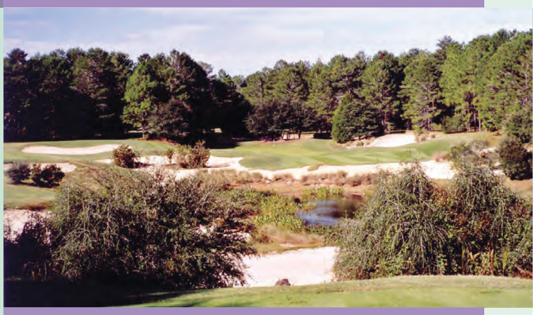
Champion Sponsor Golf Ventures / Helena Turf Products / Jacobsen