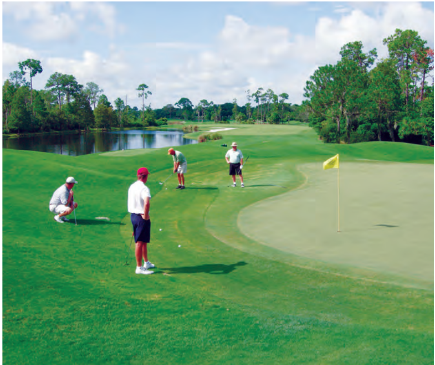
Superintendents must adjust maintenance practices in the busy winter golf season to keep the turf healthy and golfers happy.

Really we are busy year round thanks to our moderate prices and loyal customers, but play does pick up from Thanksgiving to Christmas — when it starts to cool off — and from January to May, we are wall-to-wall golfers. When it gets that busy, we don't have lots of bells and whistles that our six-man crew can employ to